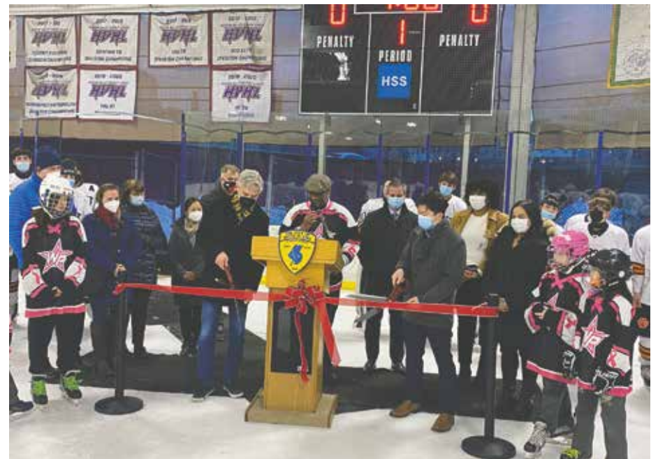
Ribbon cutting ceremony for new scoreboard was held Jan. 13.