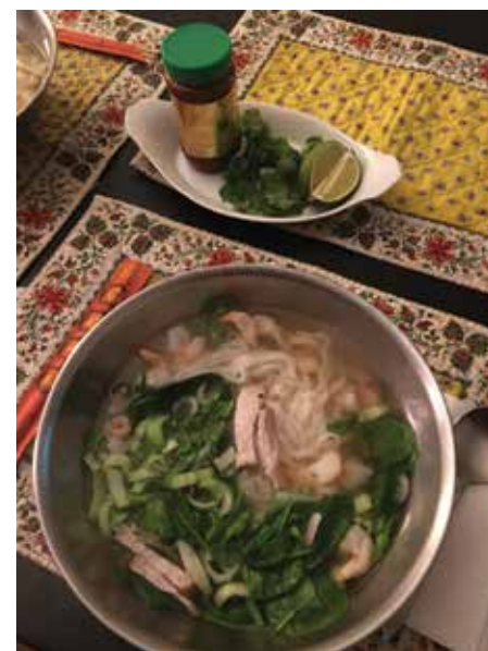
A home-made bowl of pho.

The mouth-watering honey glazed barbecue spareribs at Mister Chen in Mamaroneck, one of many outstanding choices to celebrate the Lunar New Year that begins on Feb. 1.