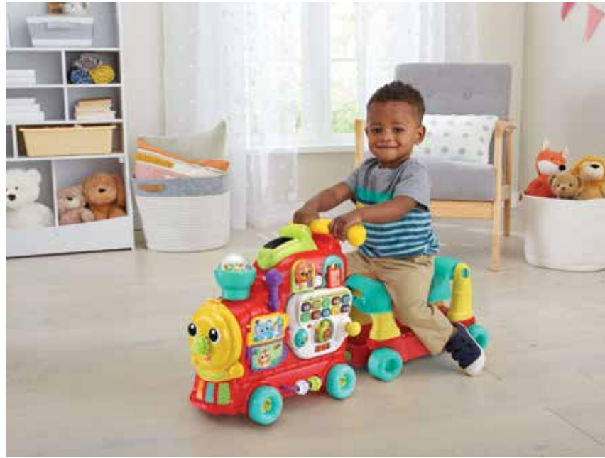
There are lots of activities and games available for parents to keep their young children active and develop their motor skills.

• Bounce around. Give little muscles and minds a mini workout with the