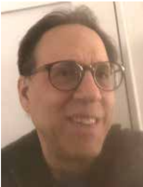
By Michael Gold

Preserving the land in its natural state allows Westchester’s towns and cities to reduce the severity of flooding from severe storms because the land acts as a