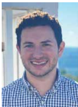
By Rick M. Pezzullo

Everyone is attempting to return to a sense of normalcy as vaccine rates slowly increase throughout the country. Part of that normalcy is just going for a casual night out to the movie theaters with your family and friends. While some may not be ready to return, the allure of the big screen and theater popcorn is enough to entice movie fans back into their seats to see the summer blockbusters that are here and upcoming. Most theaters do not require a mask, but you will certainly not be judged for wearing one and most screenings I have been to have not had full attendance. I felt comfortable going to the movies as someone who is vaccinated and going with people I knew were vaccinated as well. I know many people have gotten used to watching films at home, but as a movie nerd, I missed going with my friends for the experience of the crowd, surround sound, and special effects on an enormous screen. I'm happy to see life return to somewhat normal, even if it means I have to pay that overpriced fee for popcorn to experience that reality.