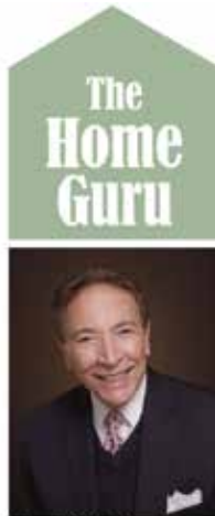
By Bill Primavera

boldness of such hues as Tuscan gold and Burgundy, right up to the early 2000s when our color choices retreated into the uncertainty of the recession at that time with the tepid beiges and pale greens. Today, however, we seem to want to color ourselves out of the neutrals and embrace pink once again as an antidote to the times.