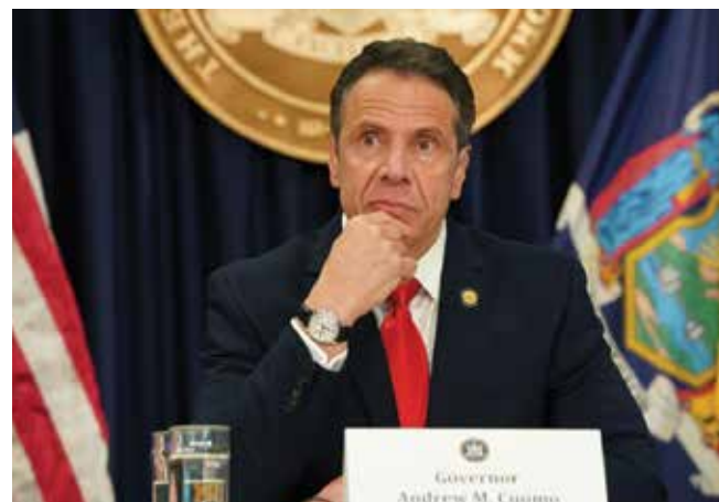
Gov. Andrew Cuomo has been on the defensive over the conclusions reached in an investigation by Attorney General Tish James.