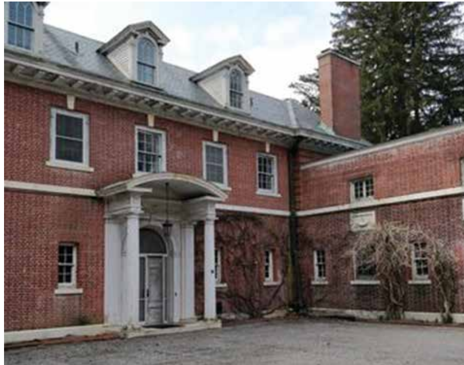
The Farm House at Merestead Park is getting a $400,000 facelift from Westchester County.