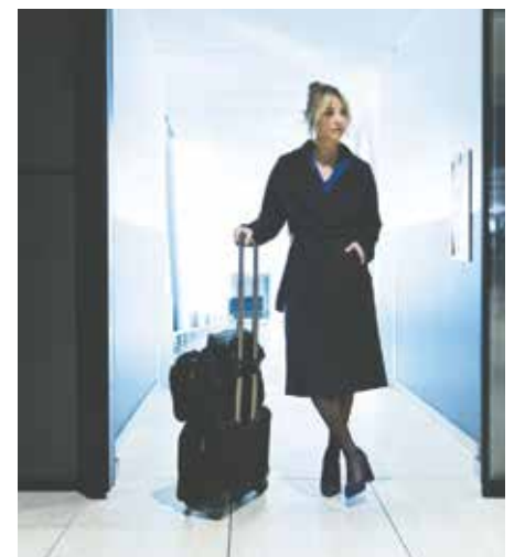
Kaley Cuoco stars in The Flight Attendant.

The 73rd annual Emmy Awards, hosted by Cedric the Entertainer, will take place September 19 on CBS and Paramount Plus at 5 p.m. PT/8 p.m. ET.