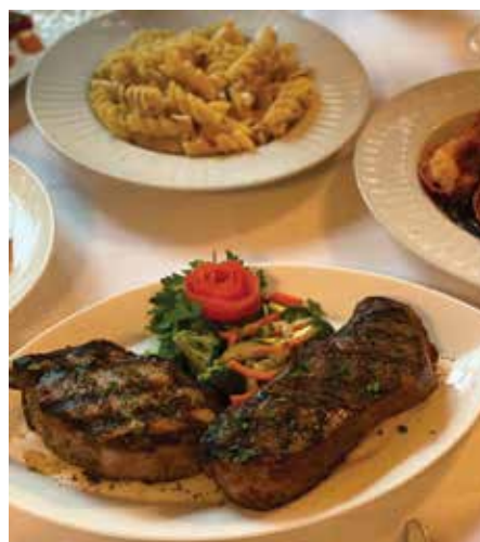
The delicious aged prime Bistecca alla griglia at Mulino's.

good burger and panini sandwiches are served at lunchtime.