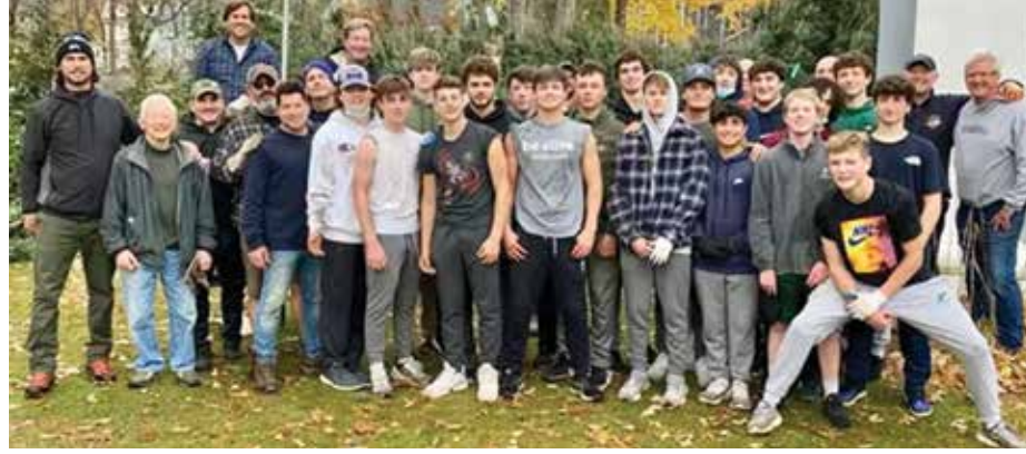
Members of the Pleasantville High School football and baseball teams who helped the Masonic Lodge unload a delivery of 650 Christmas trees two weeks ago in just over an hour.

It wasn't just that local community members