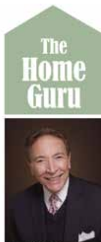
By Bill Primavera

Perhaps the Great Recession more than a decade ago served as a wake-up call to rethink how big or small we want our homes, all things considered, such as a smaller footprint providing lower taxes, lower building and maintenance costs and lower energy costs.