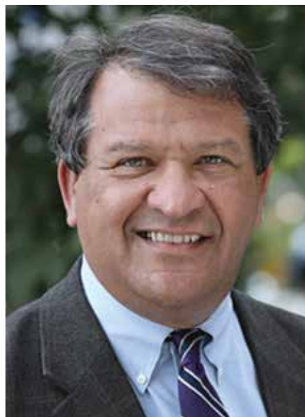
Westchester County Executive George Latimer will make an emergency declaration as COVID-19 cases and hospitalizations continue to rise.

He stopped short of calling for mask and vaccine mandates, except for continuing mask wearing in county-owned buildings and on mass transit, measures that have been in place for months.