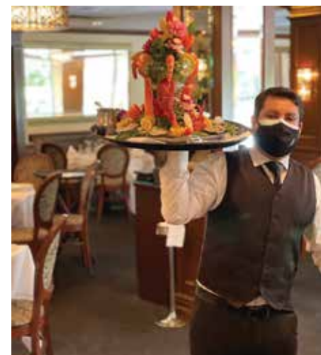
You can enjoy the cold seafood tower at Mulino's.

I have been enjoying tasty food and drink at The Barley House Restaurant Group establishments this past year. Their main