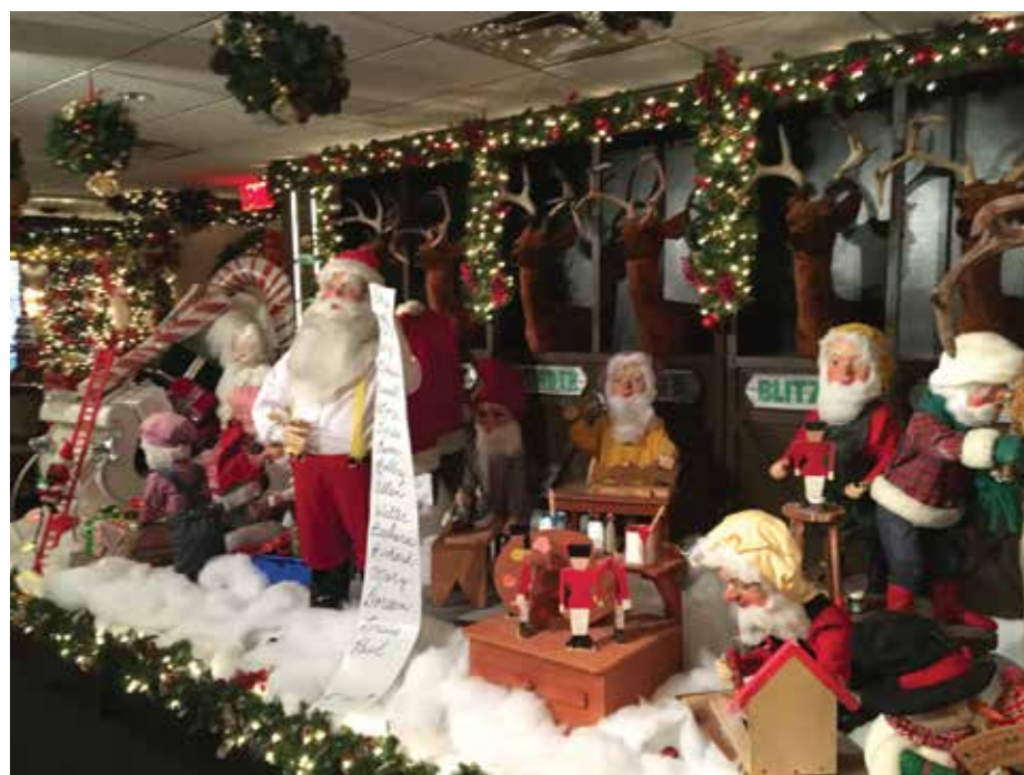
Part of the elaborate holiday display at Mulino's of Westchester, a highly regarded restaurant serving northern Italian cuisine in White Plains.

Visit the bar and lounge to unwind and there's often a buzzing business networking crowd along for the ride. A