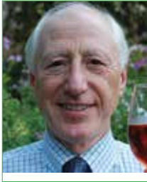
By Nick Antonaccio

I accumulate readers' questions and comments, then periodically address one of them in a column. For what it's worth, these columns are my thoughts on facts and misconceptions swirling around the wine world, which are popping up on readers' radar screens.