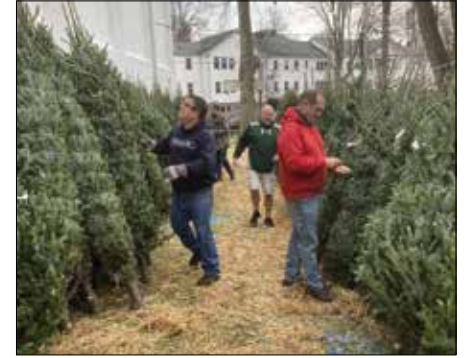
Members of the Pleasantville-Hiawatha Masonic Lodge arrange the Christmas trees they were able to obtain for their holiday sale. They once again are partnering with the Pleasantville International Association.

That all the money goes to worthwhile causes makes the sale, which takes place at the Masons' lodge, an attractive place for families