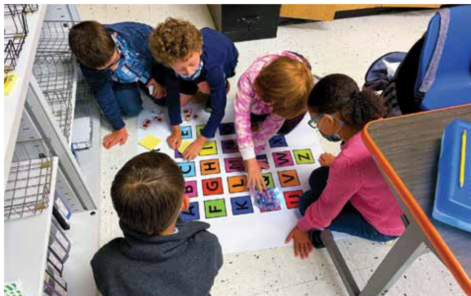
Todd Elementary School students coding blue bots, one way to help introduce younger students to coding.

"I taught the students how to code blue bots which is fairly simple and a great way to introduce coding for the younger grades," she said. "We used the blue bots to spell different words – we started with simple words, so the students would code the blue