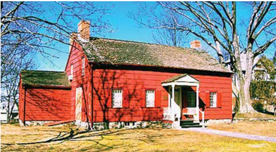
The Jacob Purdy House in White Plains, which turns 300 years old this year. It was the site of the October 1776 Battle of White Plains and housed George Washington that year and in 1778.