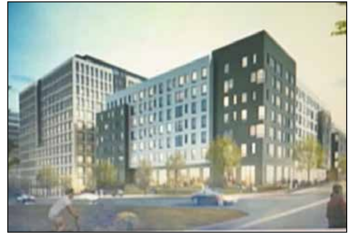
Architect's rendering in 3D of the Hamilton Building (former AT&T building) and the new Barker Building.

Board meeting. They are proposing a new design for the pedestrian plaza at City Center.