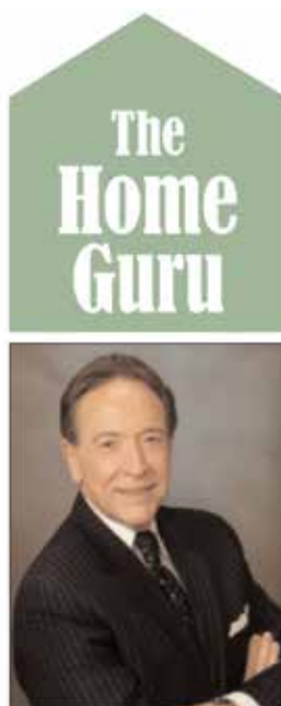
By Bill Primavera

While it isn't certain when the first person crafted a seat with a back and sat in it, archeological evidence at Neolithic sites indicates bench-like seating areas. The earliest physical evidence we have of chairs is from the Egyptian tombs from