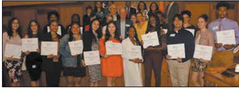
2018 Jandon Scholars with members of the Cecil Family and the Westchester County Board of Legislators.

were celebrated at a ceremony at the Rotunda of the Board's Legislative chambers Wednesday afternoon.