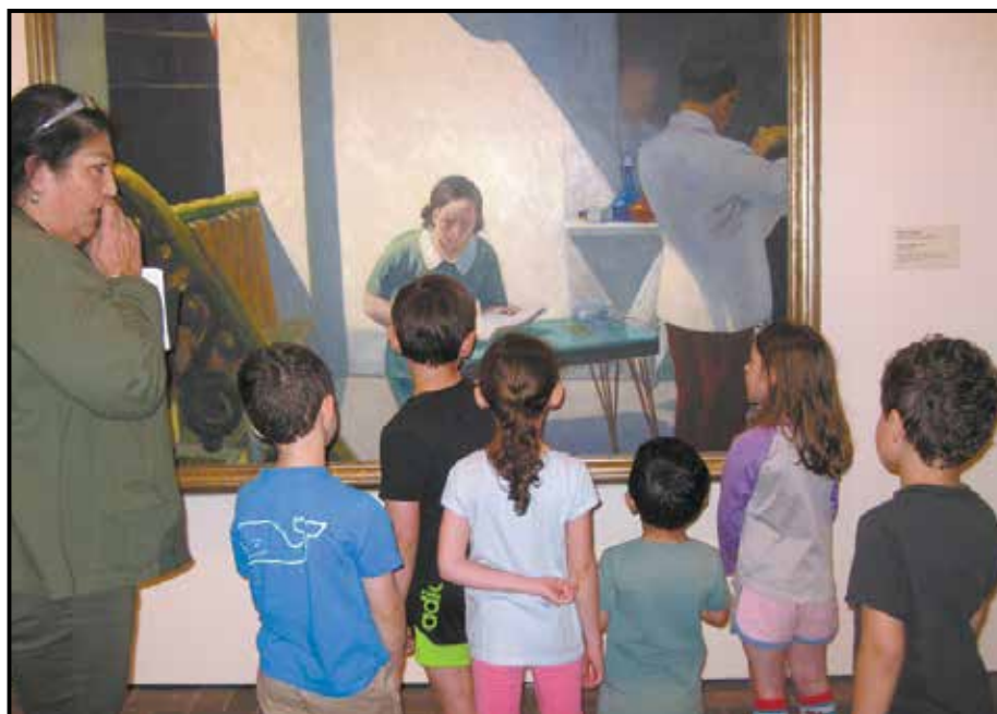
TIC students observe a painting by Edward Hopper at the Neuberger Museum in Purchase.

Both 4-year-old classes were very interested in construction and the arts. Children used wood, saws, hammers and drills to make a real Hanukiyah (a Hanukkah menorah). They used a real sewing machine to make matzah covers and repurposed a giant cardboard box