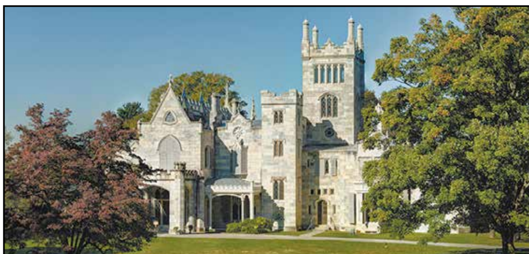
The Lyndhurst Mansion

Red Barn Bakery wares will vary but will typically include such organic items as savory tart with roasted wild mushroom, tomato and kale; veggie hand pies with lentil, kale and carrot or white beans, leeks and Heirloom tomato. Also to be offered are gluten-free macaroni and cheese and soup varieties such as carrot