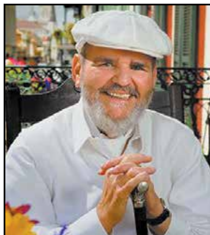
World famous chef Paul Prudhomme died on October 8.

I had lunch with him at a Chicago food-industry convention in early, 1995. At that meeting, he described how he had been pranked by Dom DeLuise, a comedian