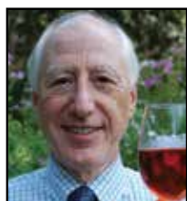
By Nick Antonaccio

Last week's column focused on the threat of climate change on wine harvests. Regardless of which side of the argument one espouses – the reality vs. the perception of global warming – it is clear that recent harvests have been impacted by warming weather patterns in most of the grape-growing regions.