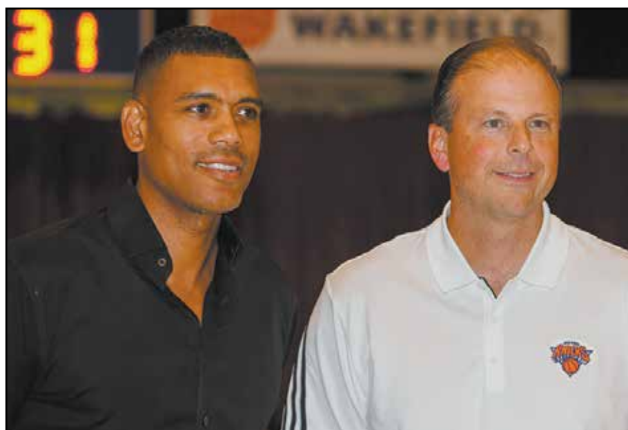
The Westchester Knicks General Manager Allan Houston (left) introduced Mike Miller (right) as the team's new Head Coach, during a free open house seat selection event on Tuesday, October 6.

Miller's coaching experience spans 25 years. Before joining the Spurs organization, he was an assistant coach