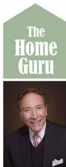
By Bill Primavera

"When we see that all segments of the marketplace (are) showing an improvement, it means health in the real estate market," she continued. "When one segment over-performs or underperforms another, it shows that something is out of balance."