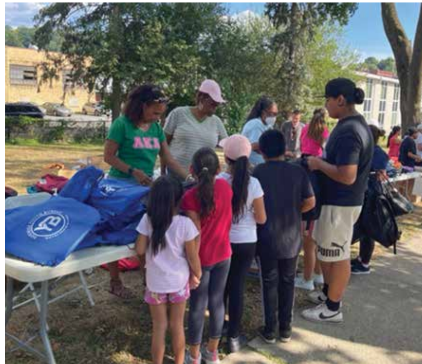
EVENTS TO REMEMBER PHOTO

For more information about Mathnasium, visit www.mathnasium.com .