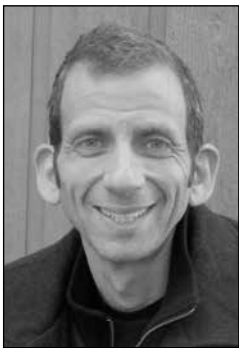
By Scott Levine

There, in that one patch of the night, we'll see our neighborhood's two biggest planets, and 162 of the solar