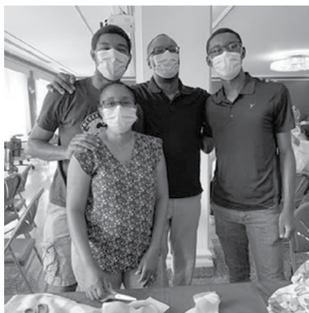
A family volunteering together to make blankets for children in hospitals as part of last year's 9/11: Serve + Remember day of service in New Rochelle. Residents will have a choice of two days to serve and help their communities during the weekend of Sept. 10-11.