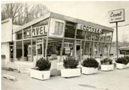
Tom Carvel’s first Carvel shop, at 95 South Central Avenue in Hartsdale, in 1937