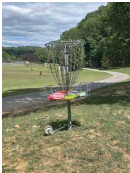
A disc golf basket at Mount Kisco's Leonard Park on Aug. 13 when members of Westchester Disc Golf Enthusiasts (WeDGE) celebrated the 45th anniversary of the park's disc golf course, one of the oldest in the world.

The sport is very similar in concept to conventional golf, but instead of striking a