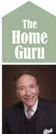
By Bill Primavera

But when I bought my first single-family home in Brooklyn Heights, I located a carpenter to build units in my living room, which featured bookcases above and cabinets below, offering a wonderful amount of display and storage space. In those days, I didn't know the difference between