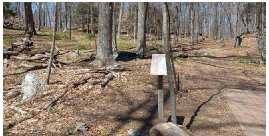
The sixth hole tee pad at the Leonard Park disc golf course.

In and around Mount Kisco, there are residents who started to become familiar with disc golf after advocates for Leonard Park began objecting to the possibility of the placement of a cell tower nearby. It is believed that the approximate location would