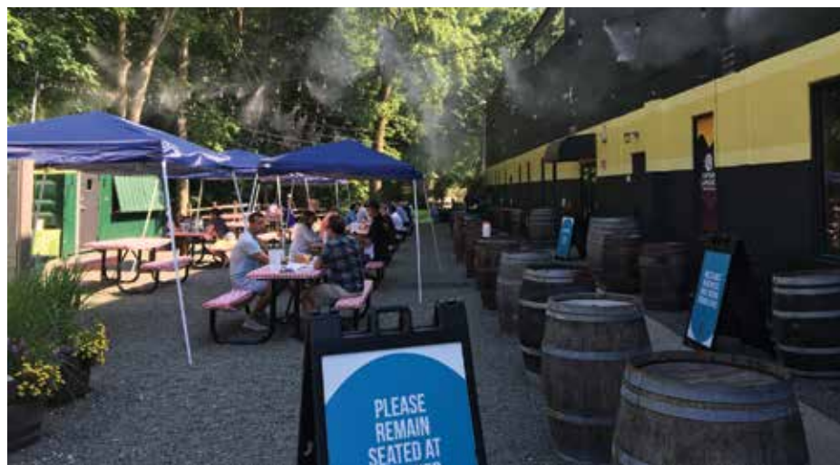
The beer garden at Captain Lawrence Brewery in Elmsford. There's a food menu that offers craft pizzas, appetizers, salads and sandwiches along with the beer selections.