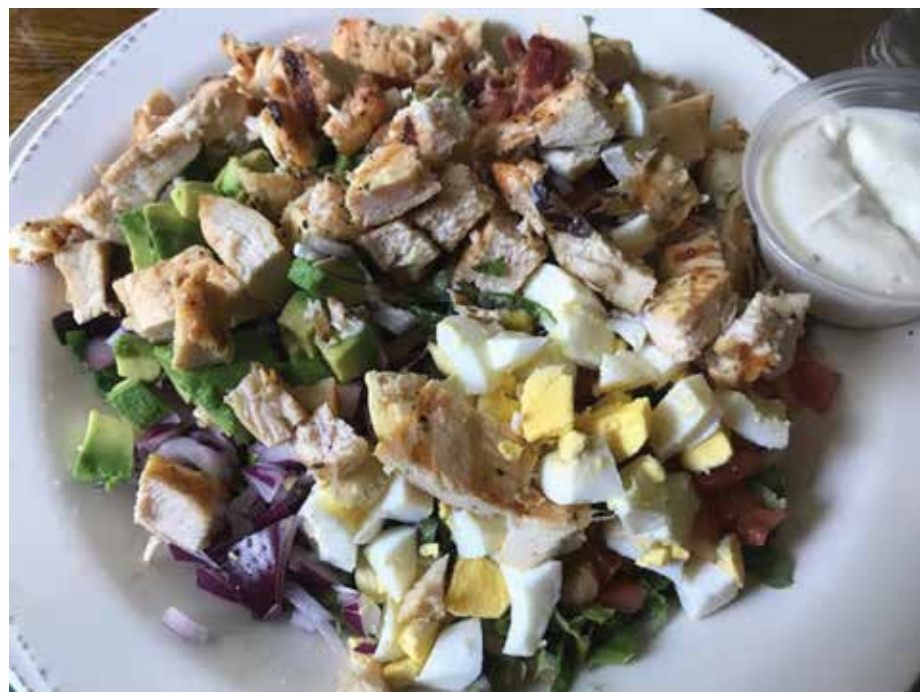
Two of the best dishes and a tasty dessert at The Cobble Stone in Purchase – the chicken chopped Cobb salad, the bacon gorgonzola burger and the house-made New York cheesecake. It is one of a number of establishments that is attractive to Westchester's college crowd.

The lighting and artsy birds hanging from the ceiling in the dining room give it a magical