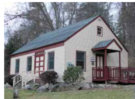
The exterior of The Capa Space, a new photography education and exhibition center, located at 2467 Quaker Church Rd. in Yorktown.

For more information about The Capa Space and the upcoming exhibition, visit www.thecapaspace.org .