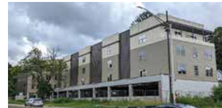
PLEASANTVILLE PLANNING COMMISSION | IMAGES

Also, instead of the cornice there is coping