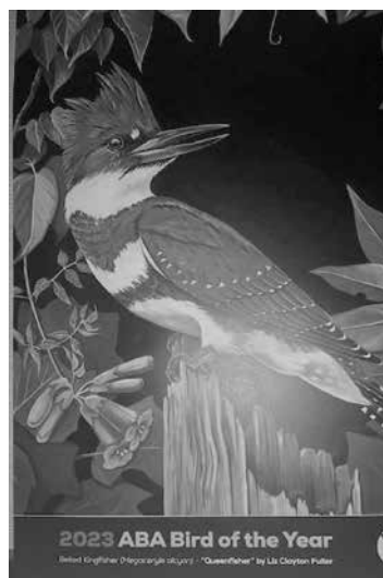
An image of the American Birding Association's 2023 Bird of the Year – the belted kingfisher.

Our small group tracked a tagged hermit thrush, and after about 30 minutes, found it above a trail. I was proud to be holding the tracking device when we reeled the sighting in, which was actually much like the sensation of getting a fish on the line and ultimately landing it. We were delighted with our high-tech