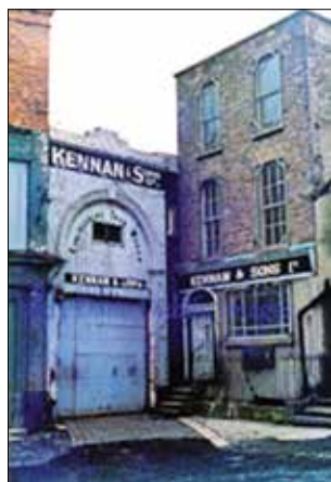
The arched gateway to Neal's New Music House, all that remained of the original theater, as it appeared in 1986.

One place that still holds its edge, while allowing improvement, is Temple