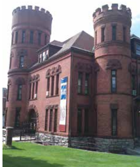
The New York State Military Museum and Veterans Research Center.

A significant portion of the museum's collection is from the Civil War. Notable artifacts from this conflict include Col. Elmer Ellsworth's (the Union's first martyr) uniform, the medical kit of Jubal Early's surgeon and the uniform and bugle of Gustav Schurmann (Gen. Philip Kearny's boy bugler). Included in the museum are significant holdings relating to New York's 27th Division in World War I and World War II and notable state military regiments such as the 7th (Silk Stocking Regiment), 69th (Fighting Irish), 71st and 369th (Harlem Hell