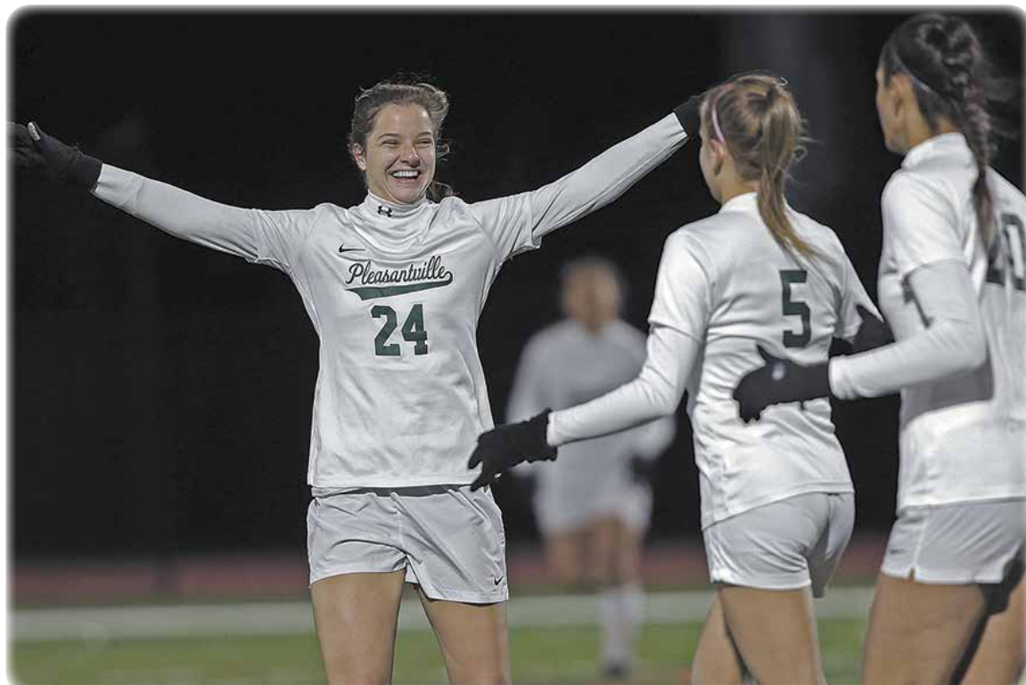
Defending NYS Class B champion Pleasantville is ready for another run for the roses in 2020

From Westchester's Class B Pleasantville to Class AA's White Plains, to Northern Westchester's Class A Somers and Putnam Counties Class AA Mahopac, Section 1 soccer fields will be lit this fall with several strong challengers looking to stake their claim as Section 1 girls' soccer champions when the season kicks off on Sept. 29 ... See Sports