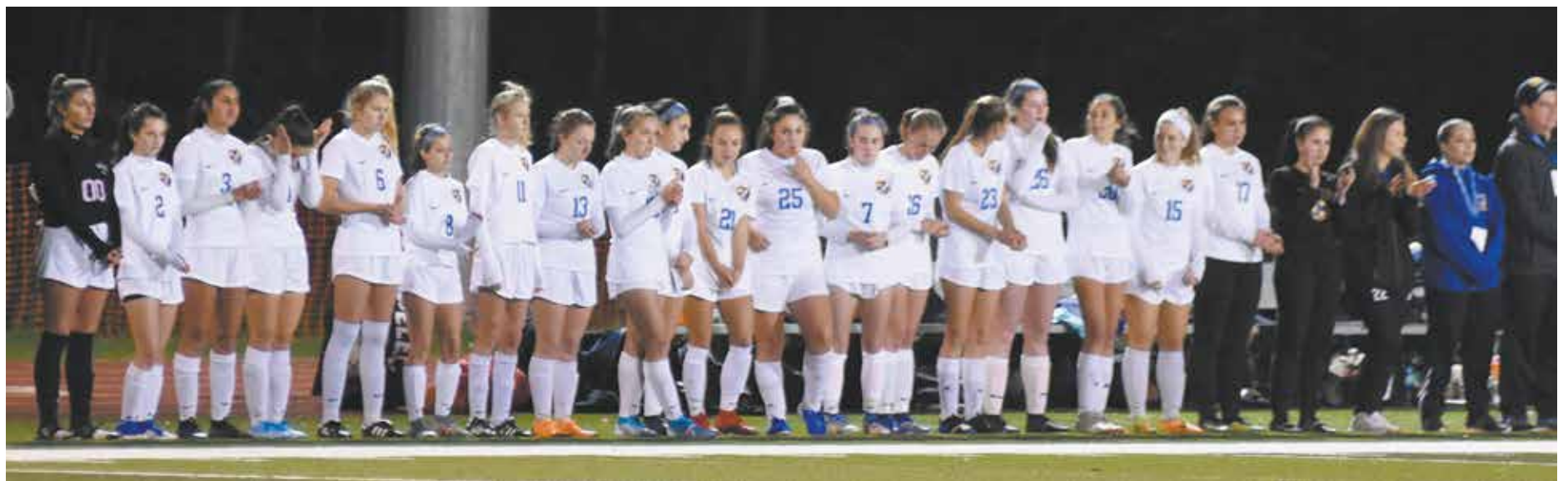
With a chunk of the 2019 team returning for 2020 season, Section 1 Class AA runner-up Mahopac hopes to take next step this fall.