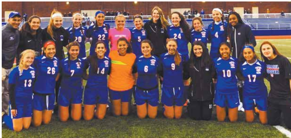
Carmel returns eight seniors to a veteran lineup in 2020.