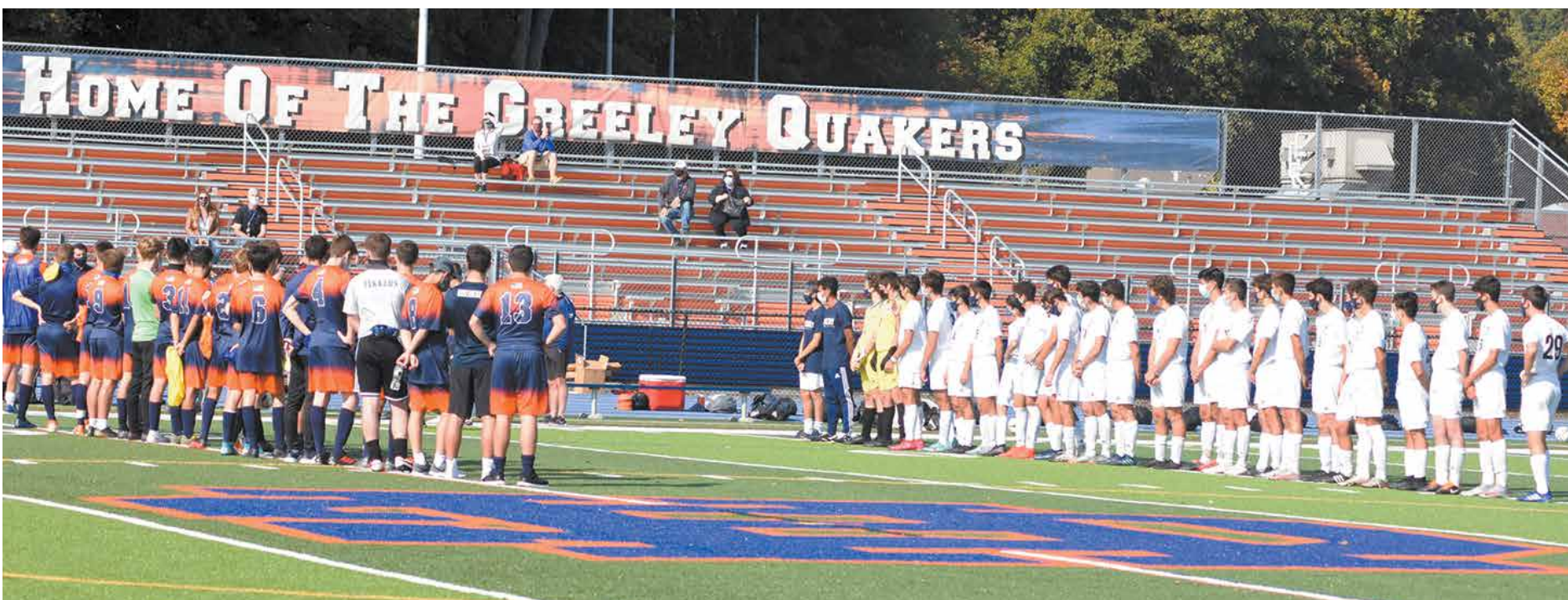
Near-empty bleachers, face coverings and distancing were part of the new normal Saturday at Greeley.