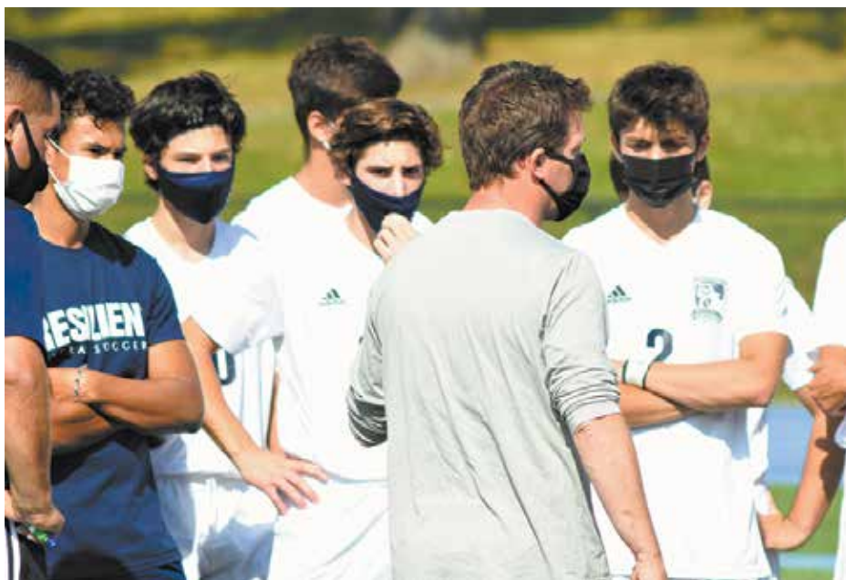
The new normal, including face coverings and/or distancing is something players & coaches will have to get used to as we battle the pandemic.

I mean, masks either work or they don't, so put one on, keep your distance, wash your hands often and go about life. At the very least we should allow Mom and Pop to watch their kids in person – as visitors – and drive them home if need be.