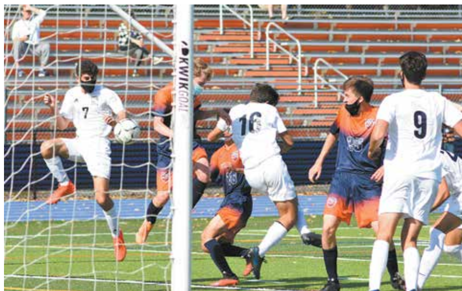
Byram Hills and Greeley players assemble en masse in Bobcats' 3-0 league triumph of host Quakers Saturday.