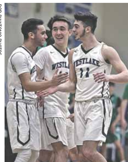
Westlake players had plenty to celebrate after defeating the Irvington Bulldogs in the opening round of the Class B playoffs last Thursday.

The Wildcats were scheduled to host No. 13 Pleasantville, a local rival they had defeated twice during the regular season, in the quarterfinals on Feb. 24.