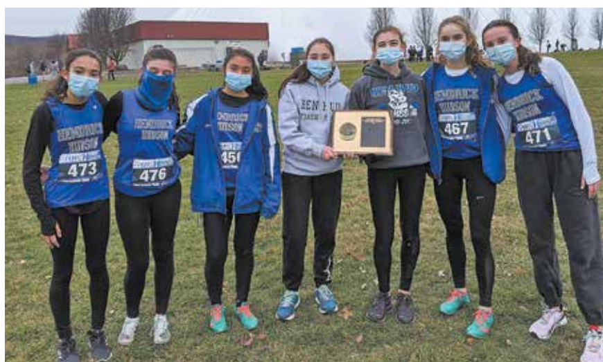
Hendrick Hudson girls' cross country team finished off with a Putnam-Northern Westchester Regional Small School Championship Sunday at Milton.