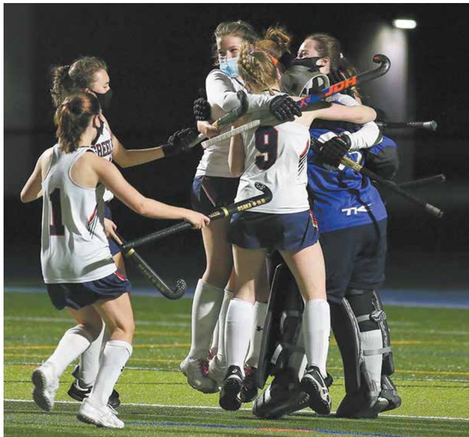
Greeley players celebrate Quakers' 2-0 win over visiting Carmel in Friday's Put.-N.West. Large School Regional title win.