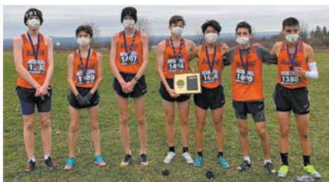
The Briarcliff men's cross country team won the Put.-N. West small school division and placed third of out of 44 schools overall, a tremendous showing in Milton.