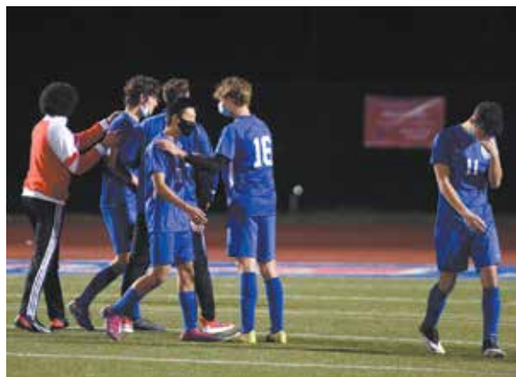
Dejected Carmel players leave field after season-ending 2-1 OT loss to John Jay CR in Put.-N.West. large School Regional title game Friday.