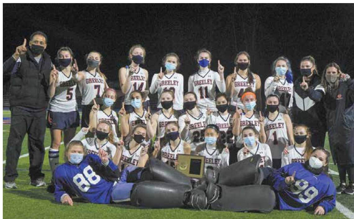
Greeley players pose with championship plaque after Quakers' 2-0 win over Carmel in Putnam-Northern Westchester regional final.