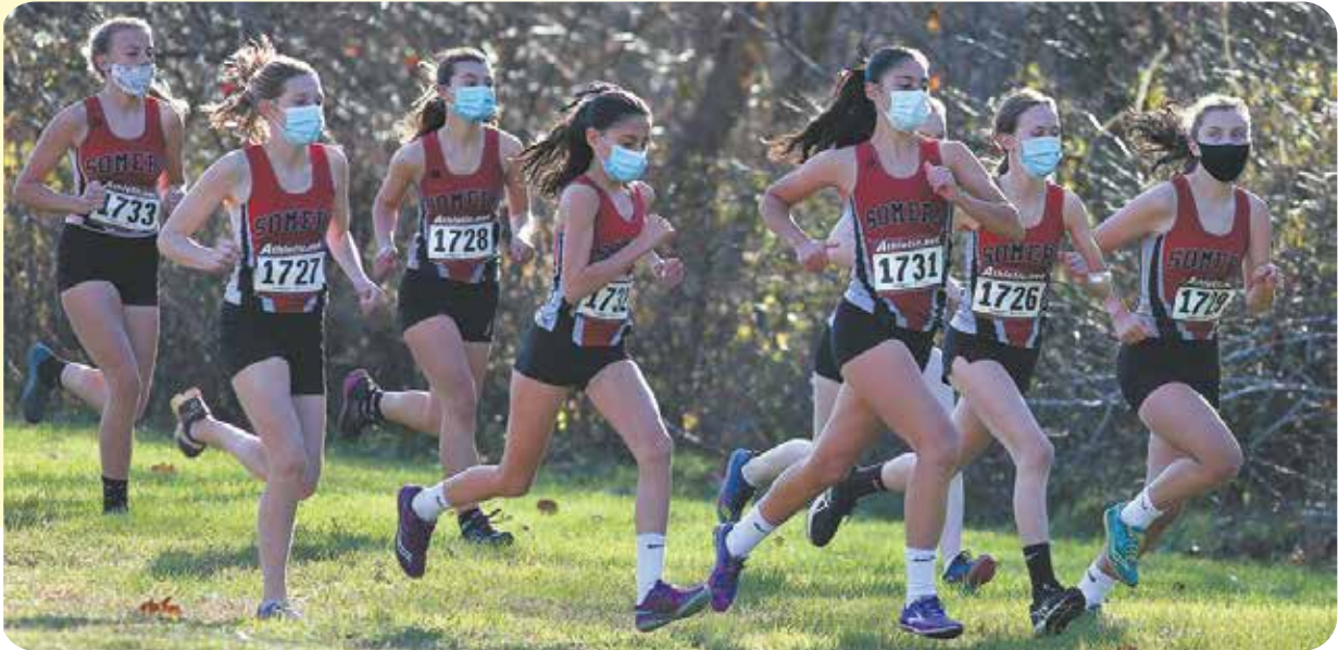
A pack of Somers girls cross-country athletes runs near the start of the race en route to a dominant first-place league finish.