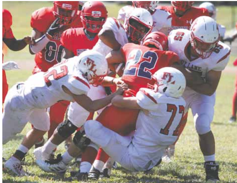
Fox Lane gang tackles a Peekskill back.