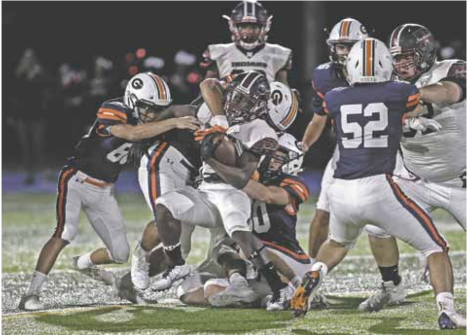
The Horace Greeley defensive unit makes a tackle in the first half of Friday night’s 48-14 loss to Nyack.