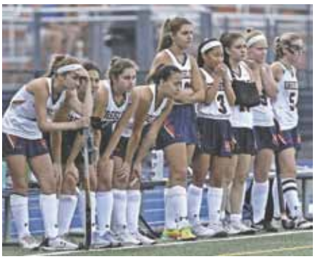
The Horace Greeley bench looks on anxiously in the latter stages of the second half of last Tuesday's game.