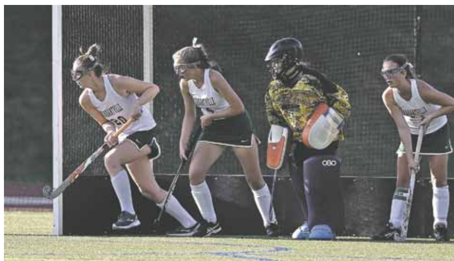
The Pleasantville field hockey defense guards the goal during a White Plains penalty corner late in Friday's game won by the visiting Tigers.