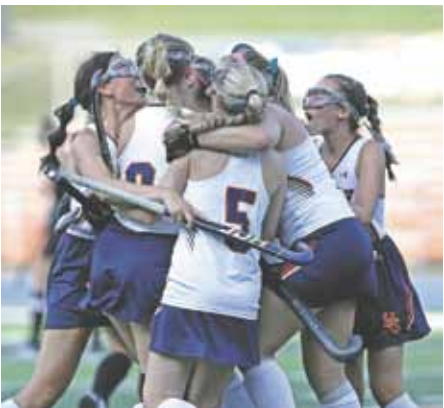
Greeley players celebrate after scoring their lone goal in last week's 1-1 tie vs. Mamaroneck.