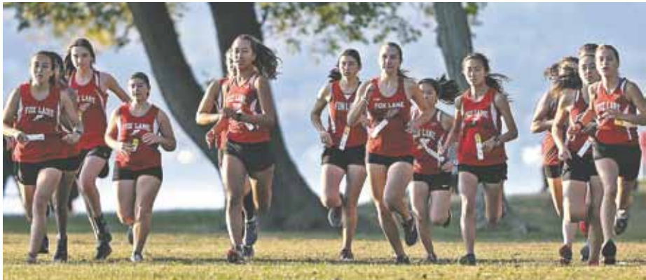
Members of Fox Lane's girls' cross country team run together at the start of last Tuesday's league championship meet at Croton Point Park.