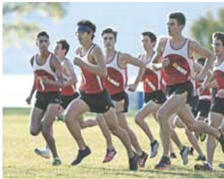
Fox Lane boys start their three-mile run during last Tuesday's league championship meet at Croton Point Park.