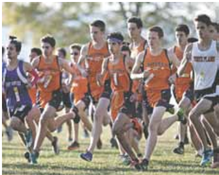
Horace Greeley boys are bunched together at the start of last Tuesday's League 1D Championship at Croton Point Park.