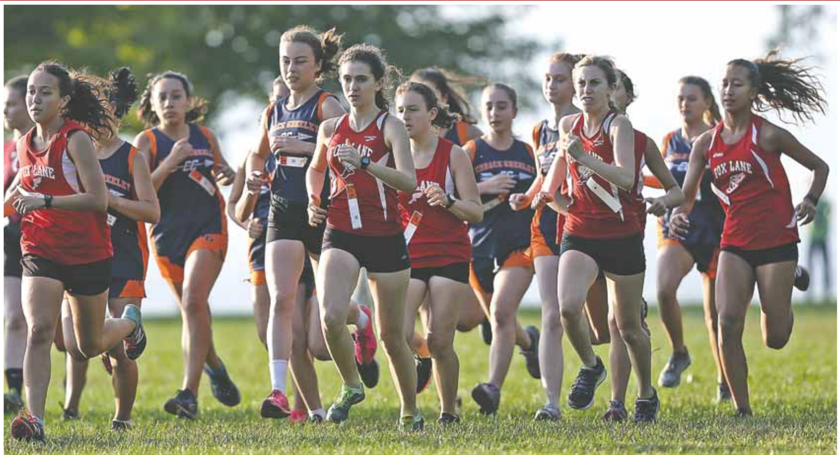
Fox Lane and Horace Greeley runners are bunched together at the start of last week's League 1D championships in Croton. The Quakers placed four finishers among the top six to take the team title.