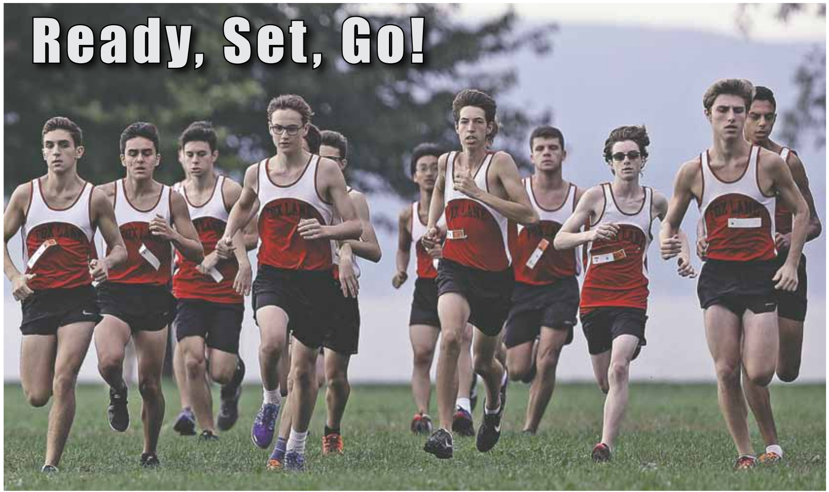
Runners from Fox Lane High School start their 5000-meter race at last Tuesday's league championships at Croton Point Park. The Foxes finished in first place among the five teams, narrowly edging Horace Greeley.