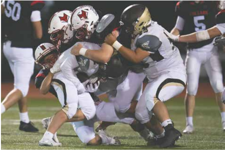
Fox Lane defenders swarm Viking RB in Foxes' loss to Clarkstown South.