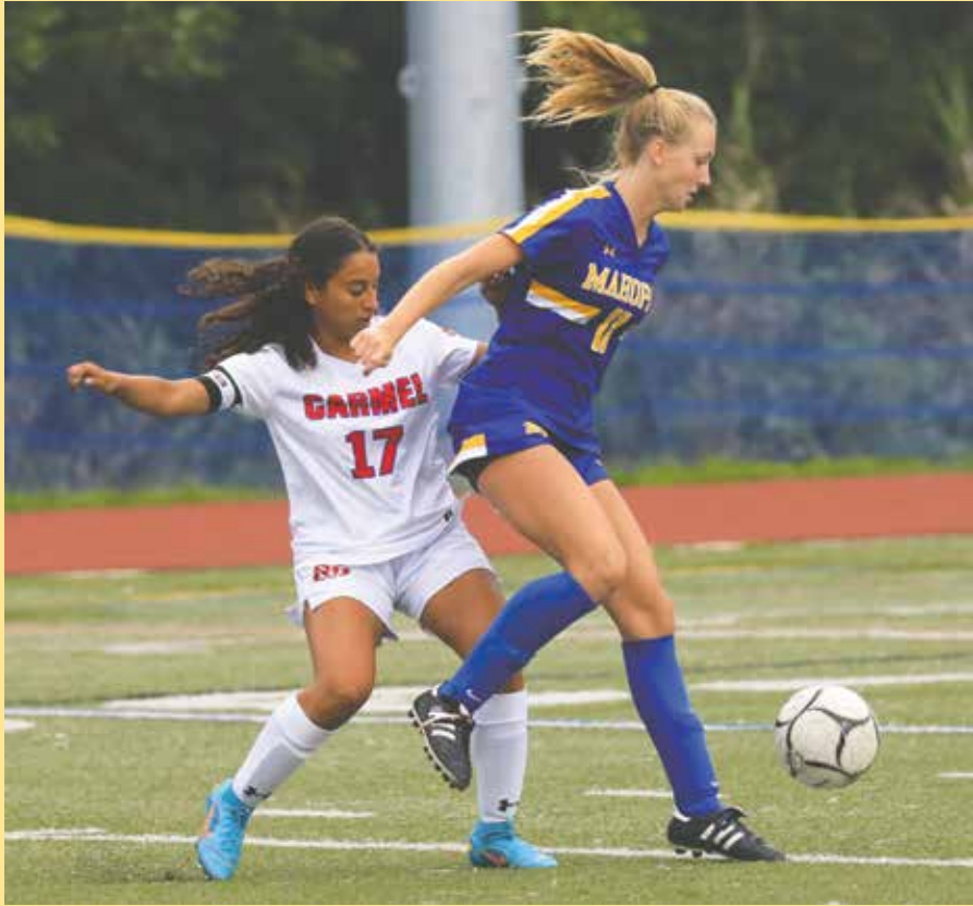
GIL MCMAHON PHOTO CREDIT