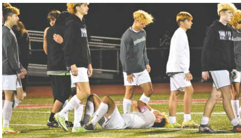
A tough Yorktown team is hoping to avoid a situation similar to this in 2022.