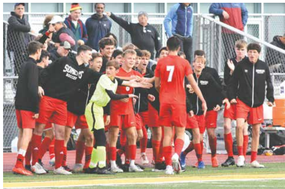
The torch has been passed to these guys at Somers where the defending state champs are chomping at the bit.

2021 Record & Playoff Result: 9-8-1, lost to Eastchester in the round of 16 by a score of 1-0