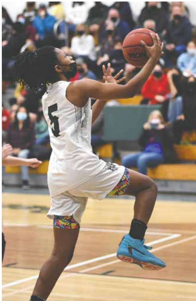
Brewster's Bre Washington goes up for shot in Bears' 66-28 win over visiting Greeley last Tuesday.