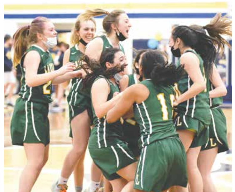
Lakeland girls revel in their 60-55 win over rival Walter Panas in Saturday's Giglio Games.