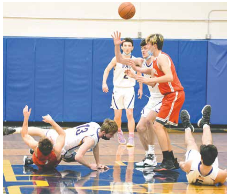
Bodies will surely hit the floor today when Somers hosts Mahopac today with league bragging rights on the line.