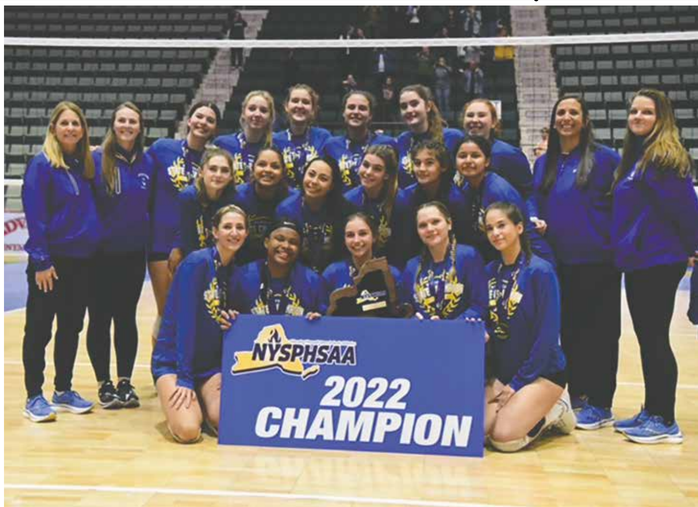
Hen Hud players and coaches pose with 4th NYSPHSAA title plaque after Sailors swept Section 5 champ Wayne Sunday at Glens Falls.

“They shared success together and worked together as a family. And this weekend, the family worked very well together.”