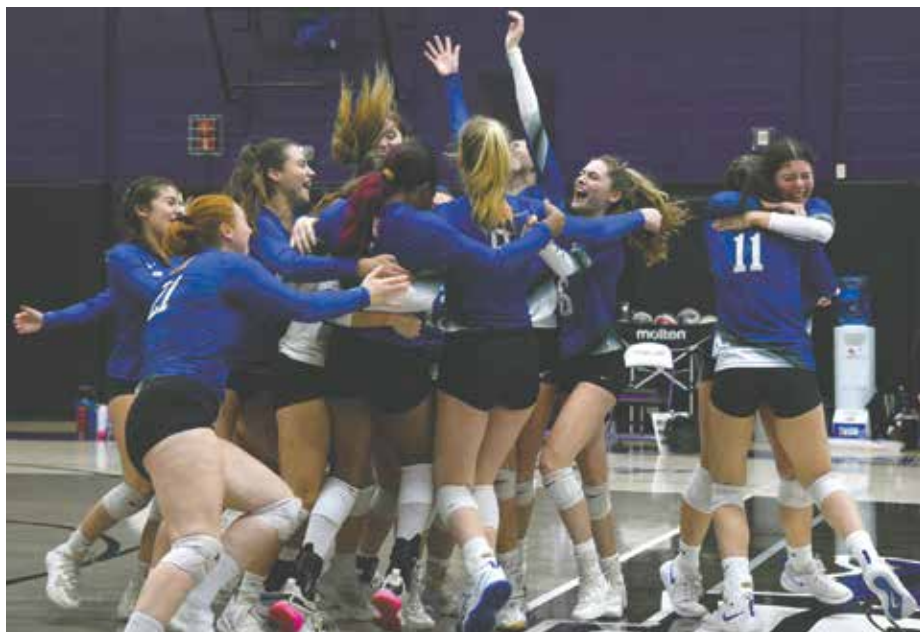
One of many typical scenes for the Hen Hud Sailors en route to their fourth NYS title last Sunday at Glens Falls.