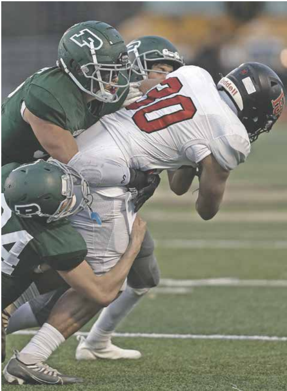
The Pleasantville defense swarms to make a tackle against Section 9 champ Port Jervis during Friday’s Class B regional playoff game.