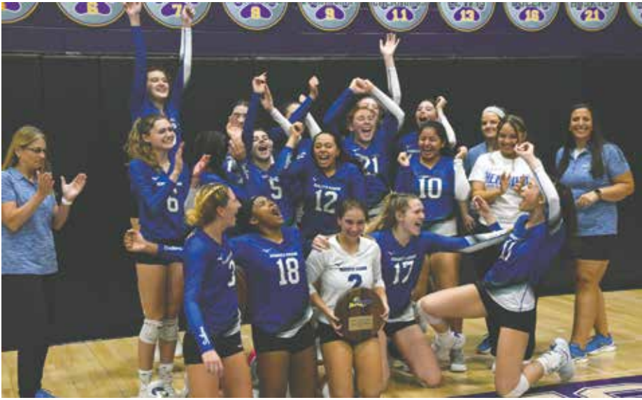
Hen Hud players and coaches celebrate Sailors' 11th NYSPHSAA regional title win since 2000 after 4-set romp of Section 4 champ Maine-Endwell Saturday.