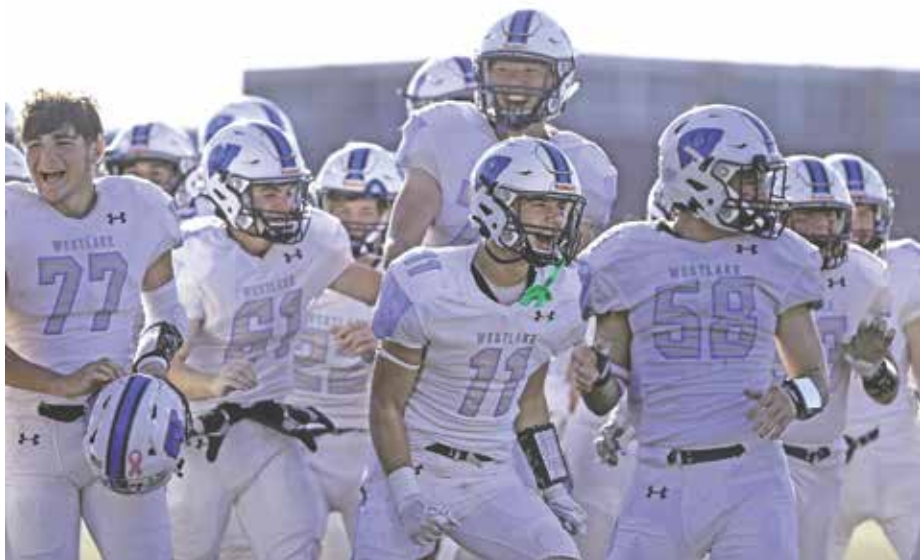
Westlake players celebrate their 46-14 victory over Dobbs Ferry in Saturday afternoon's Class C championship game at Mahopac High School.