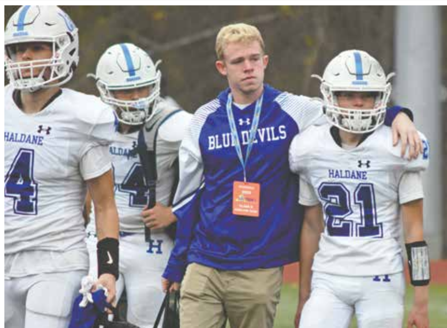
Haldane players and coaches took Class D title loss to Tuckahoe hard Friday morning at Mahopac.