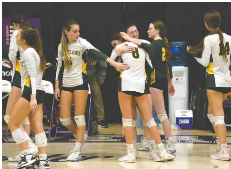
Lakeland players come to grips with the fact that the best season in Hornet history has ended in NYS Class A regional title setback to Section 9 champ Cornwall.