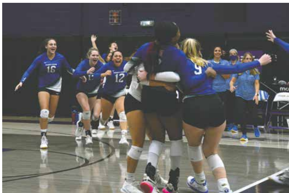
Jubilant Hen Hud players storm court upon taking the NYSPHSAA Class B regional title after 4-game romp of Section 4 champ Maine-Endwell Saturday at John Jay CR High.