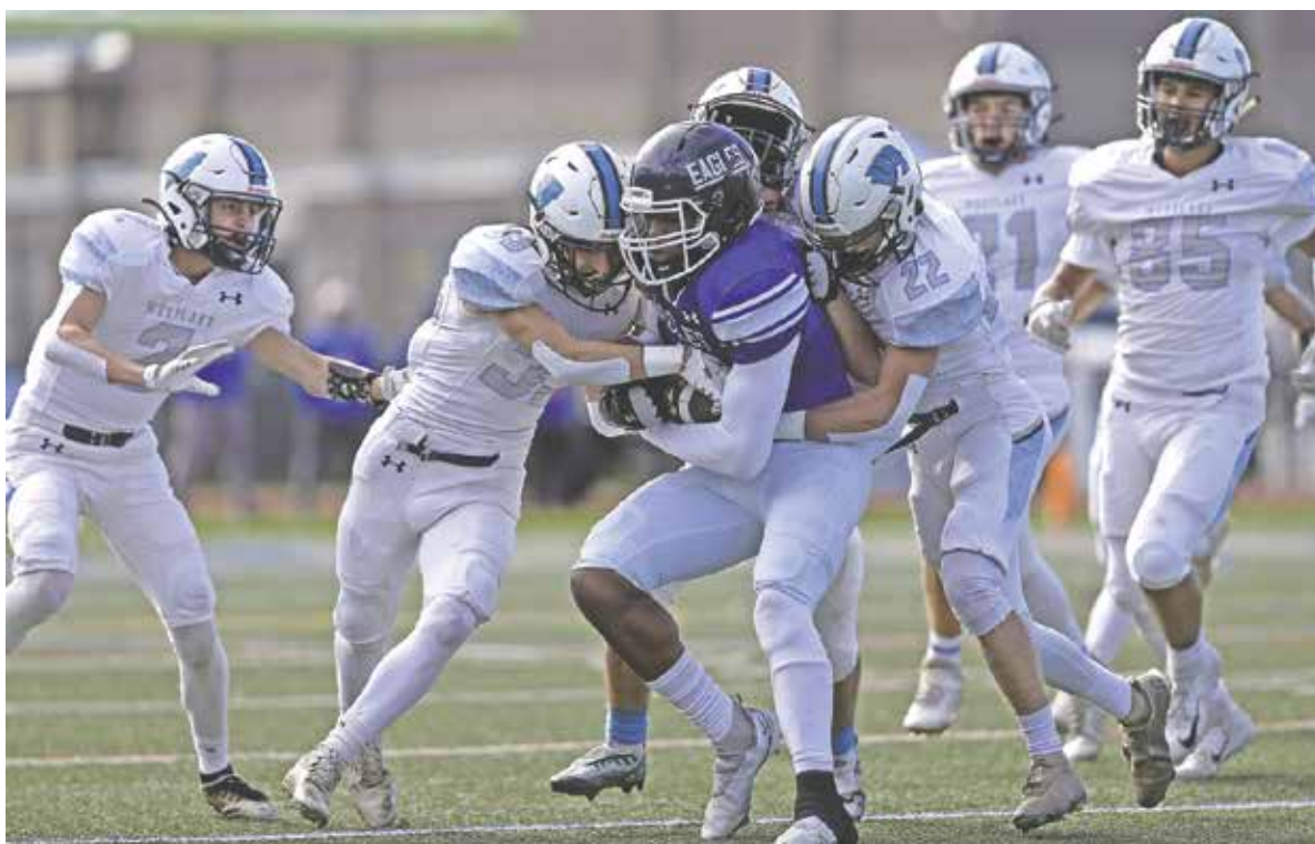
The Westlake defense throttled Dobbs Ferry after the first drive of the game and helped pave the way to the 46-14 rout of the Eagles in the Class C final.