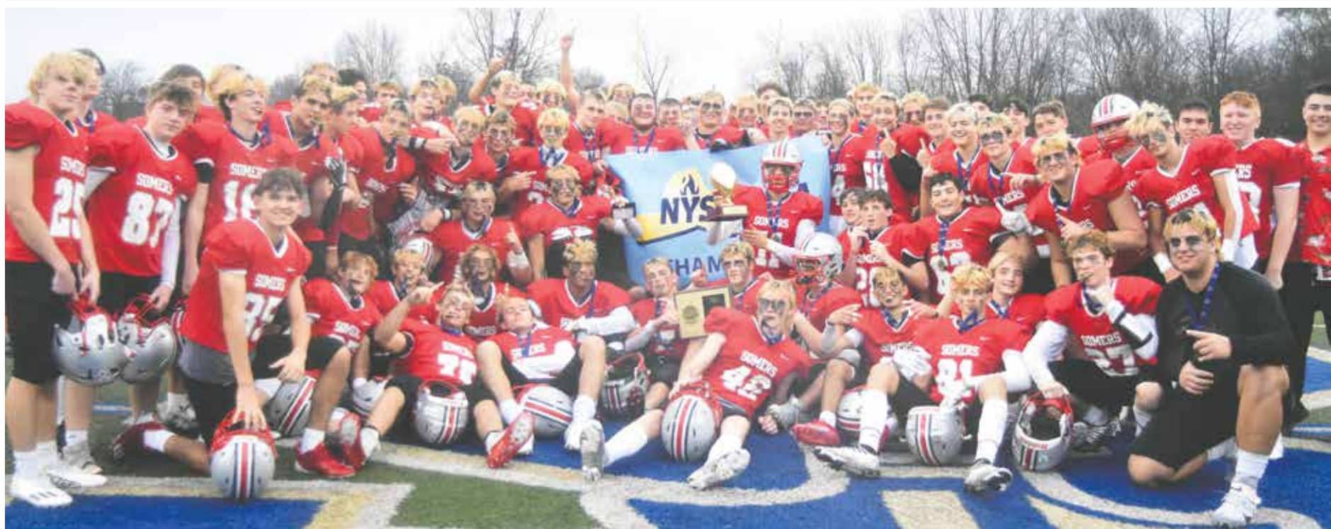
Somers Tuskers pose with Section 1 championship hardware for the sixth time since 2012 after hammering Rye, 45-13, Friday at Mahopac.