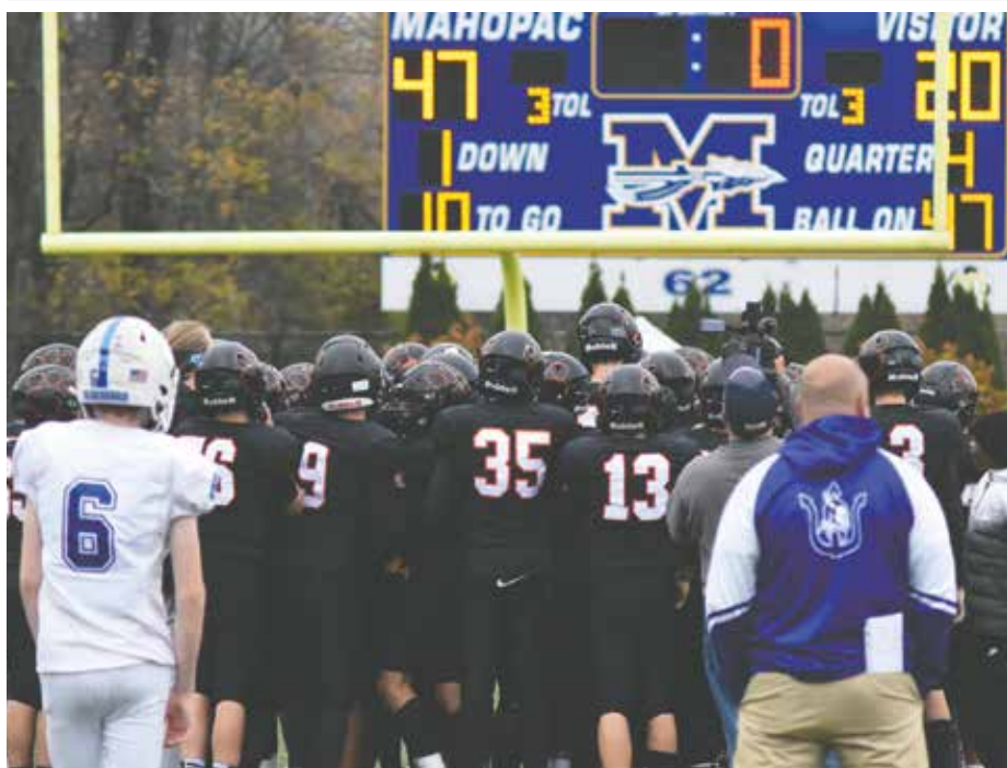
A scene no Haldane player or coach hopes to see next year in Class D title game against defending champion Tuckahoe.