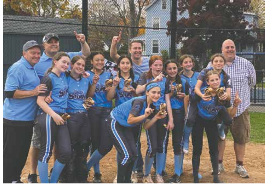
The KLBS 14U Blue Storm celebrate winning the chip.