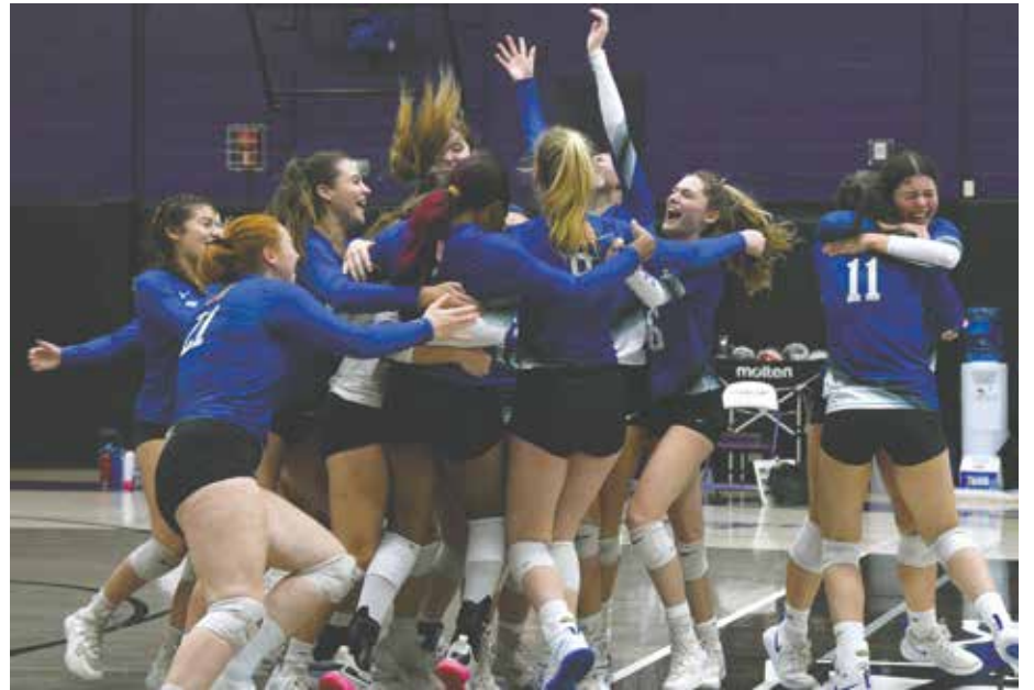
The joy in Sailor-land was evident after Hen Hud won its 11th NYSPHSAA regional title since 2000 Saturday over Section 4 champ Maine-Endwell.