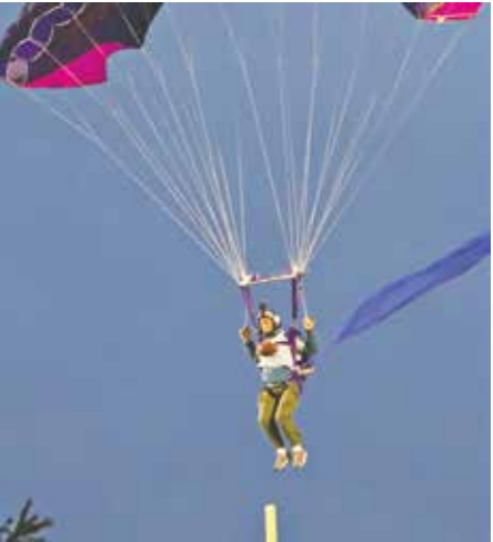
Sparing nothing on Homecoming Day, Mahopac drops the 'Game Ball' in play in Indians' 28-21 loss to Somers.