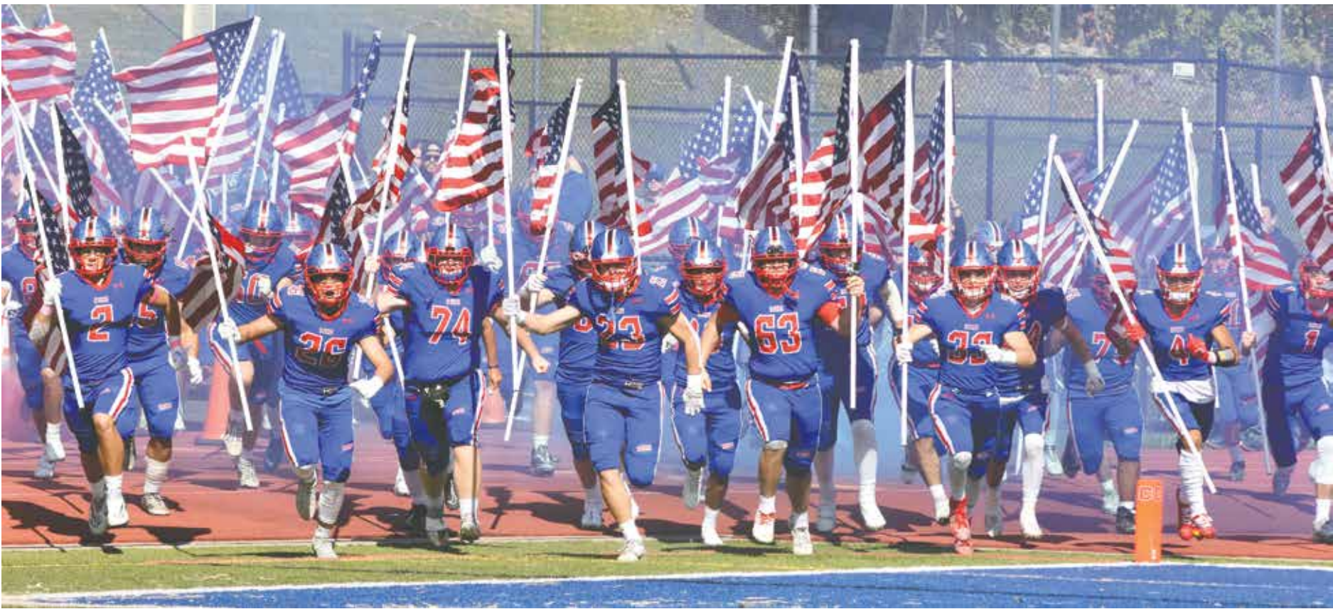
Among the great spectacles in Section 1 sports, the Carmel Rams storm field, USA flags in tow #OldGlory, before routing Mt. Vernon 43-6 on Homecoming Day last Saturday.