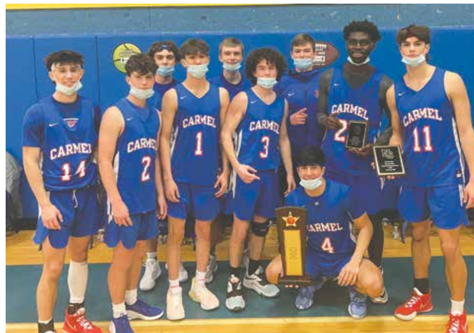
Carmel Rams pose it off after taking the North Salem tourney title Saturday.