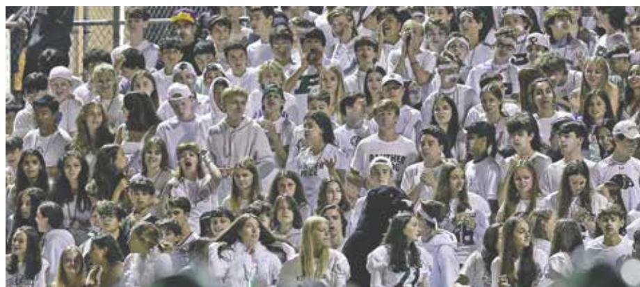
Pleasantville students cheer on their Panthers from the bleachers in the opening half of Saturday night's football game at Parkway Field vs. rival Briarcliff.