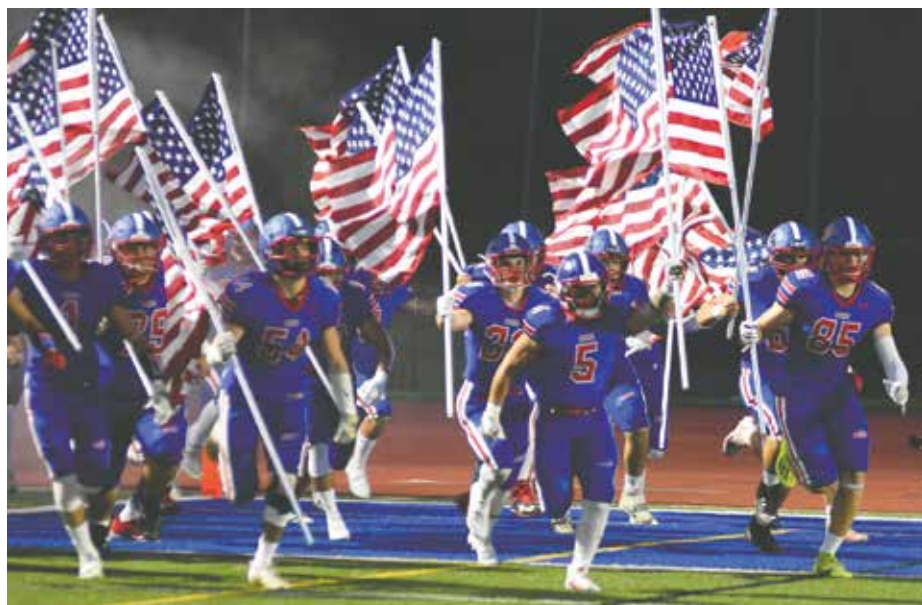
One of the great scenes in Section 1 sports as Carmel takes center stage Saturday night before routing New Rochelle, 28-0.