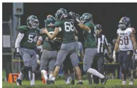
Pleasantville players celebrate a touchdown late in the first half of their 27-12 victory over the rival Briarcliff-Hamilton Bears this past weekend.