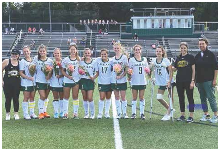
Lakeland seniors and coaches gather on Senior Night prior to 8-0 win over Panas.