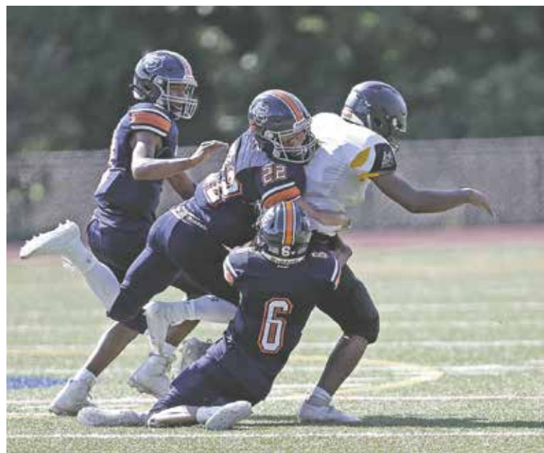
The Briarcliff/Hamilton defense gangs up to make a tackle in the first half of Saturday's home game against Nanuet.

"I don't think we played our best game today," he said. "But hopefully we get better every day. Yes, we lost the game, but this is where we wanted to be — building a program that when I took over had 20 kids. Now we're at 41 kids and they work hard every day and they're just gonna get better."