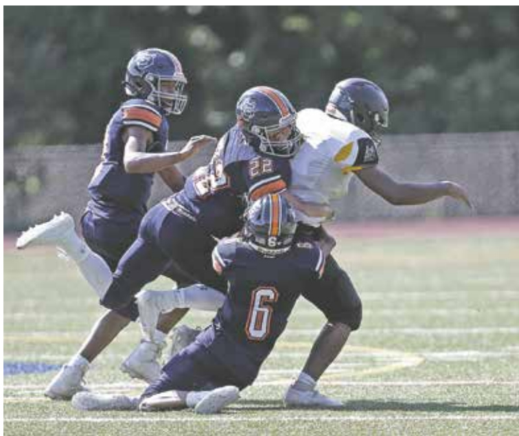
The Briarcliff/Hamilton defense gangs up to make a tackle in the first half of Saturday's home game against Nanuet.

"I don't think we played our best game today," he said. "But hopefully we get better every day. Yes, we lost the game, but this is where we wanted to be — building a program that when I took over had 20 kids. Now we're at 41 kids and they work hard every day and they're just gonna get better."