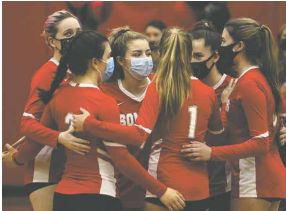
Somers defeated Brewster twice last week in volleyball (3-0, 3-1).