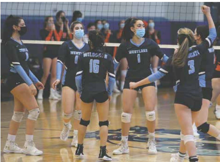
Westlake celebrates on its way to a 25-19, 25-17, 25-19 sweep of Briarcliff on Friday.