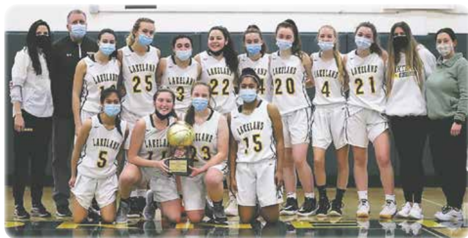
Lakeland players and coaches pose with ceremonial gold ball after beating rival Panas 41-36 in annual Giglio Games Saturday.

standing between Mahopac and the League B title after the Bears continue to mash. Brewster went 2-1 last week improving its record to 4-2 on the season. Last Tuesday, though, Mahopac sent a message in 60-38 win, blowing the Bears out in the second half.