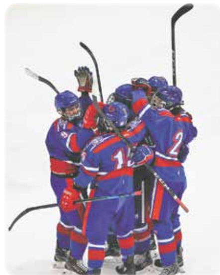
Carmel had plenty to celebrate last week, including 11-7 win over rival Mahopac last Wednesday at BIA.