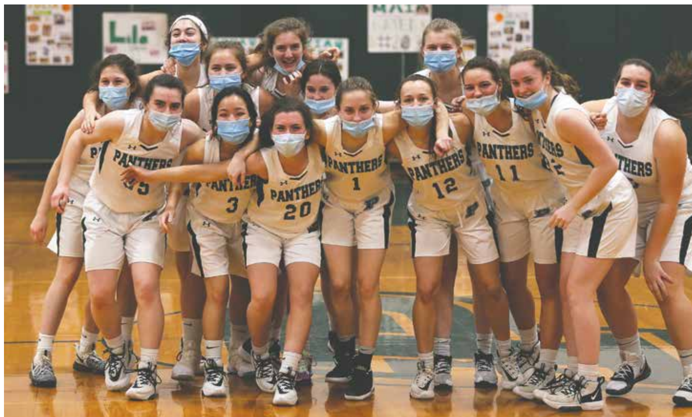
Pleasantville celebrates a hard-fought 53-51 semifinal win over perennial power Irvington.

"She will leave a gaping hole in leadership,