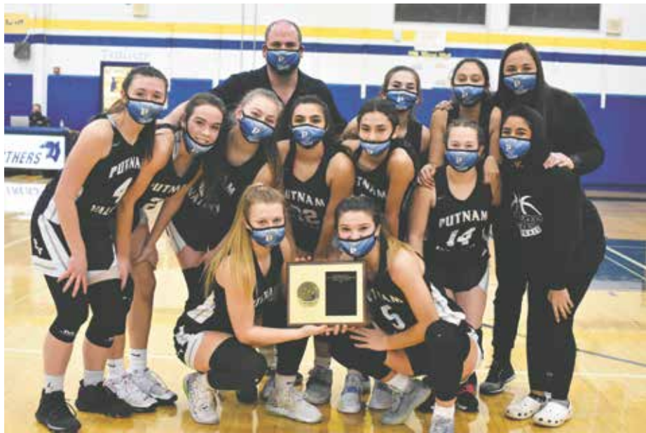
Putnam Valley players pose with the P-NW regional title plaque after knocking off Panas, 52-40, in Saturday's regional final.