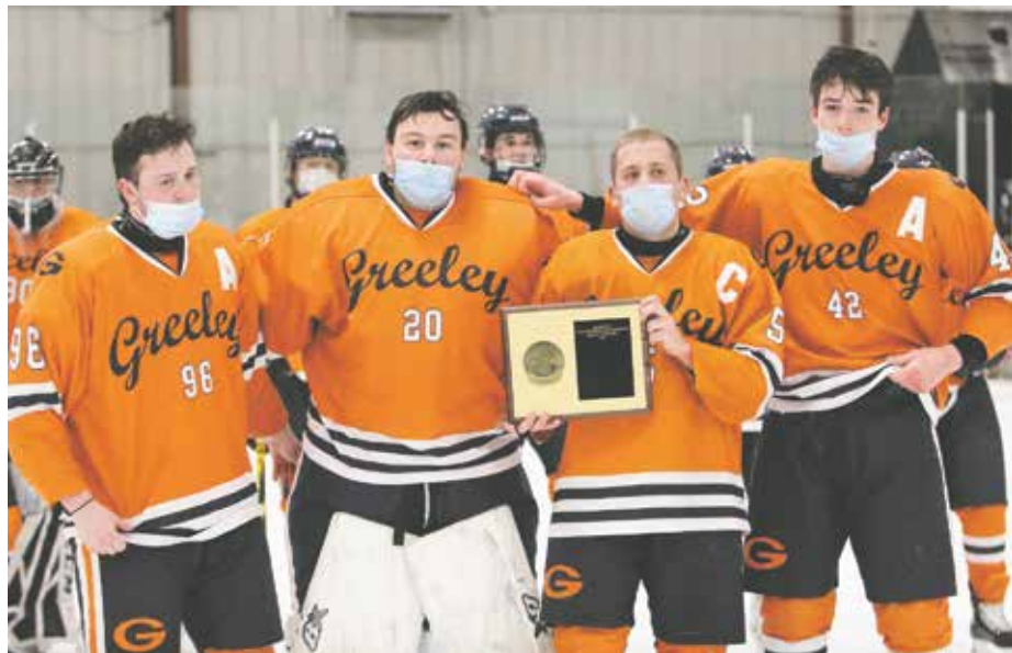
Horace Greeley players pose with P-NW runner-up title plaque after Quakers were knocked off by John Jay, 5-1, Saturday at the BIA.