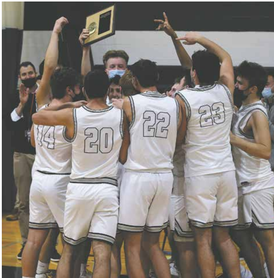
Byram Hills players hoist hardware after 63-45 win over Sleepy Hollow in S. West. regional final.