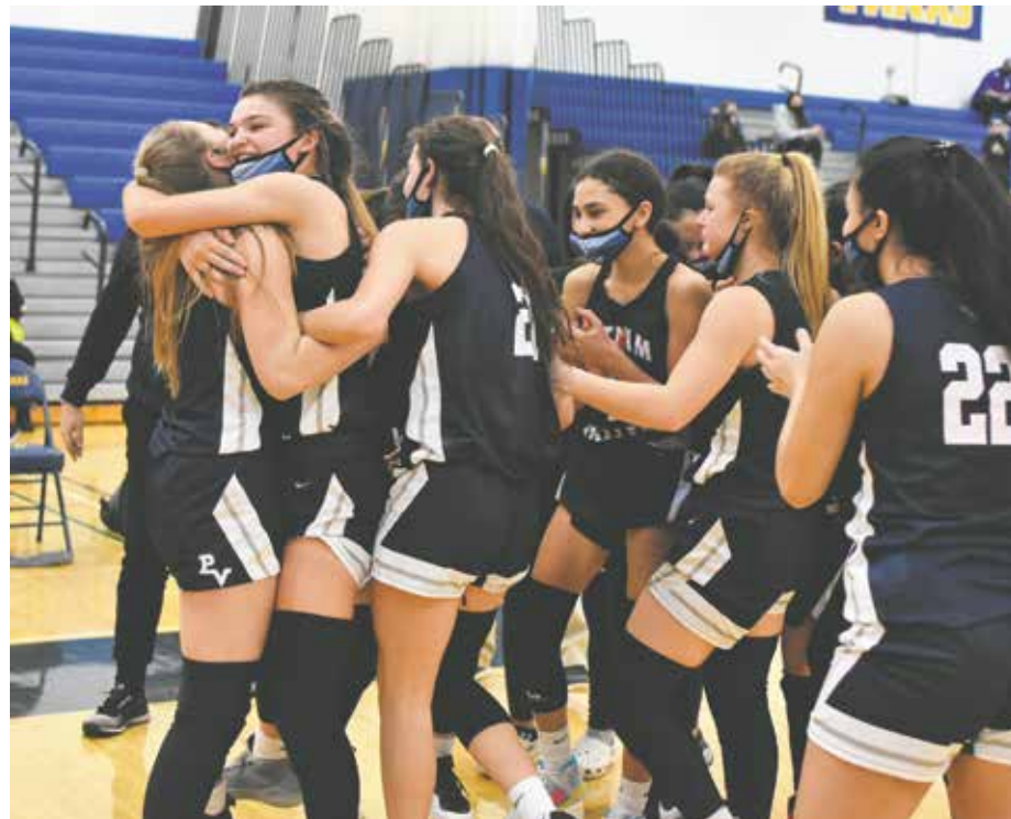
Putnam Valley players celebrate their second title in as many years after beating Panas 52-40 for P-NW small school regional title Saturday.