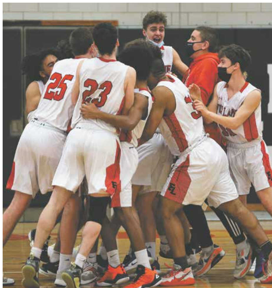
Fox Lane players rejoice after knocking off Mahopac for the Putnam-North. West. large school regional title Saturday.