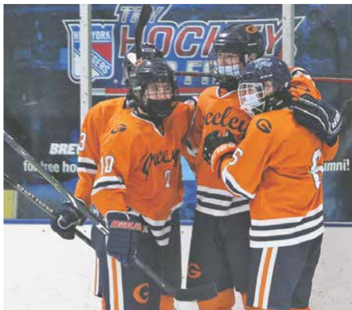
Quakers celebrate an early goal in semifinal win over Mahopac.