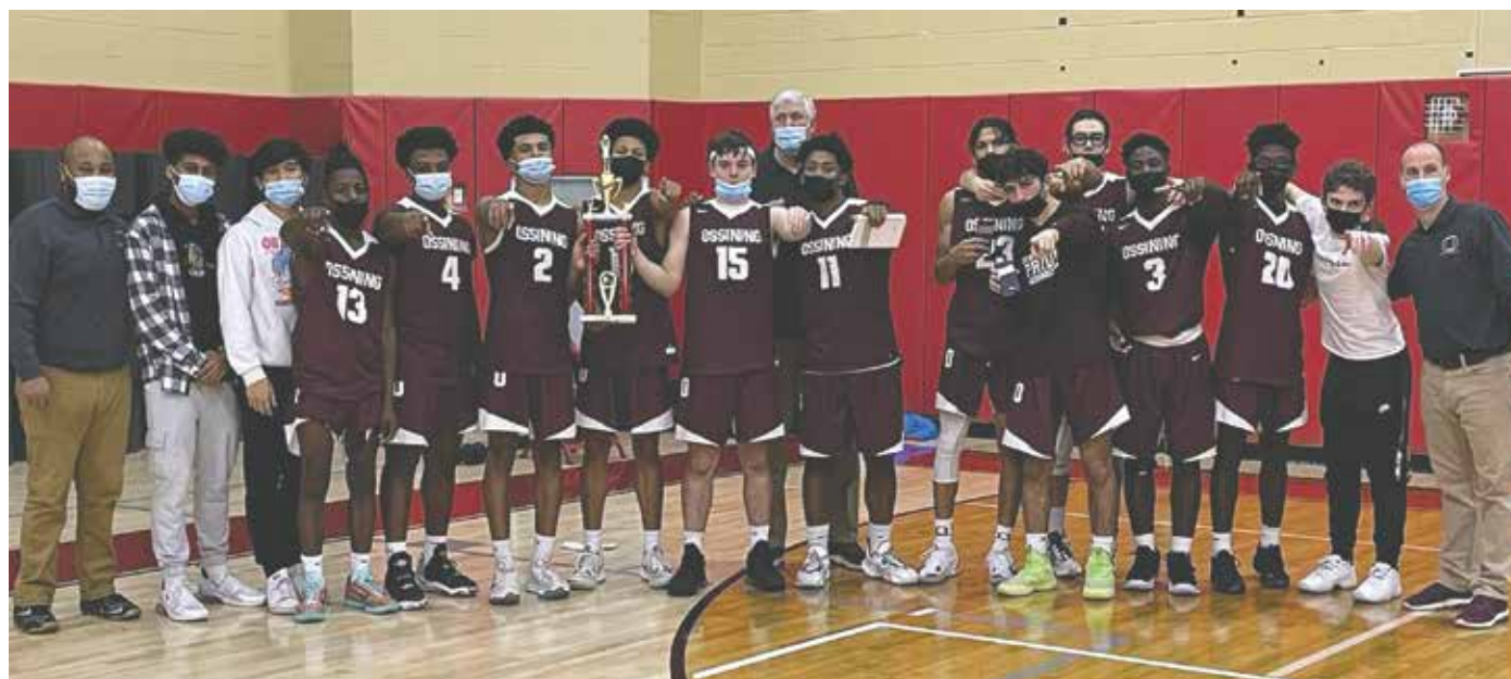
Ossining poses with hardware after pulling off 65-64 come-from-behind win for Somers tourney title.