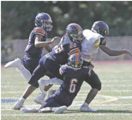
The Briarcliff/Hamilton defense makes a tackle during an early-season home game.