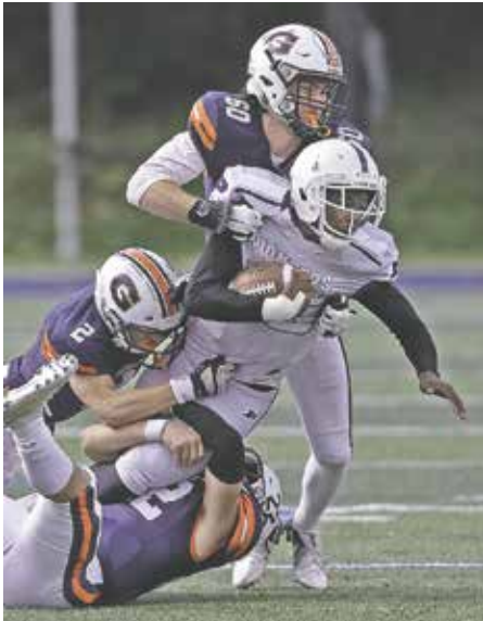
The Greeley defense makes a tackle in the win at Poughkeepsie for the Independent League championship.