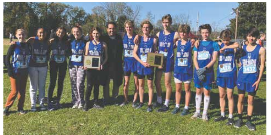
The Haldane girls and boys' X-C teams were crowned Class D champs Saturday at Bowdoin Park.