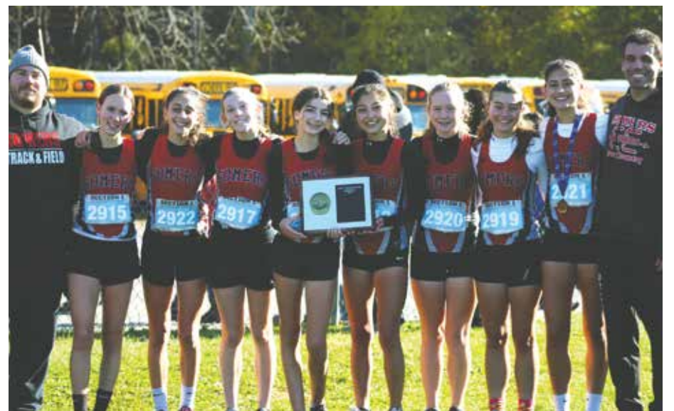
Somers girls cross country team and coaches proudly pose with sectional Class B runner-up title plaque Saturday.