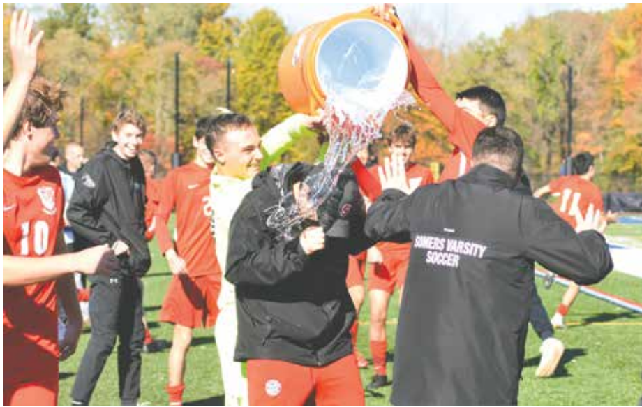
The Gatorade showers have become par for the course for Somers coaching staff.