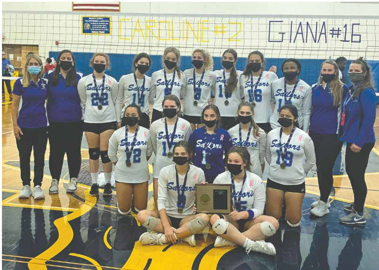
Top-seeded, undefeated Hen Hud poses with hardware for 16th time since 2000 after sweeping third-seeded Briarcliff, 25-14, 25-14, 25-8, Saturday at Mahopac.

Now that Panas returns to state play, where it