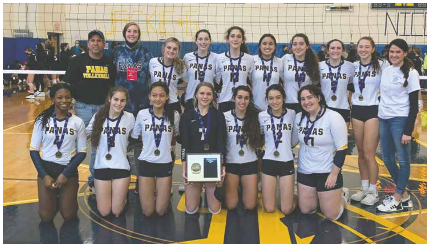
Walter Panas volleyball players pose with Section 1 title plaque after thrilling 5-set Class A championship win over Nyack at Mahopac High Saturday.