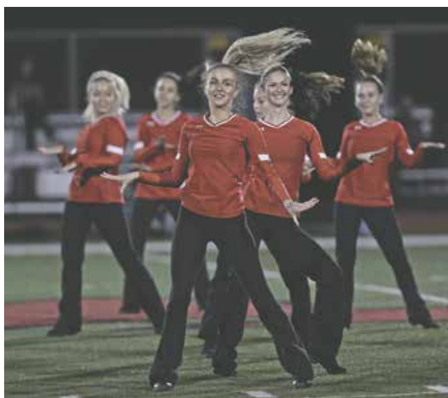
Members of the Fox Lane dance team perform at halftime of Saturday's football game.