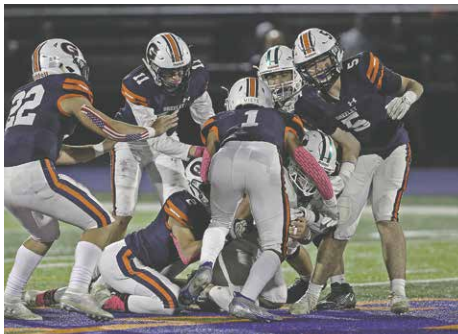
The Horace Greeley defense swarms to make a tackle in Friday's 21-6 Homecoming victory over the Irvington Bulldogs.