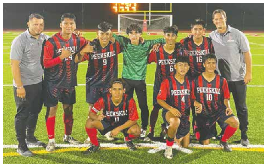
Peekskill seniors pose with coaches after knocking off state-ranked Lourdes Friday.