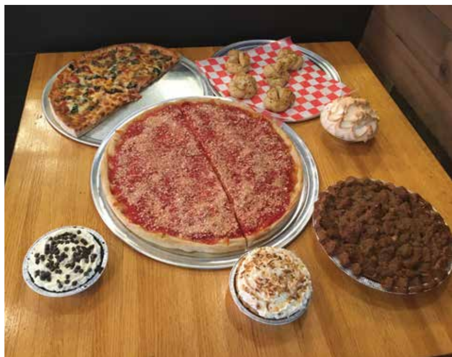
Some of the tasty specialties at the reopened Utica Pie Co. in White Plains.