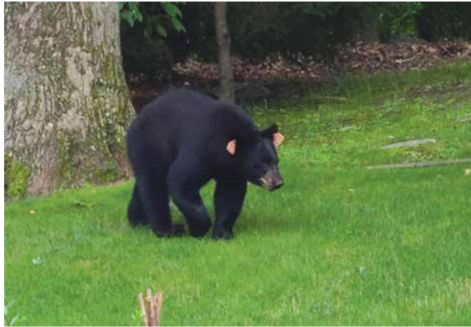
A photo of Bear 211 during one of its many sightings in Connecticut.