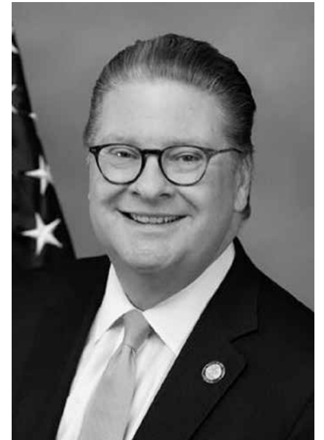
State Sen. Peter Harckham

"Where is our moral outrage regarding the latest overdose statistics and the lack of insistence that the overdose crisis be met with a massive response?"