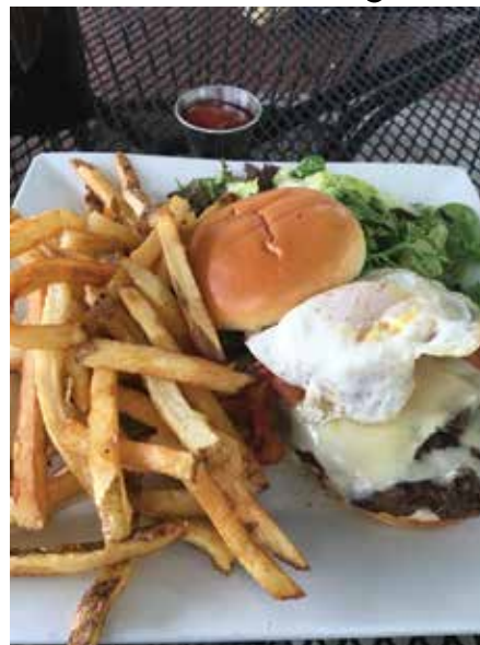
French bistro Le Jardin’s signature Burger du Roi, with bacon, Swiss cheese and sunny side egg on top, and the restaurant’s popular bread pudding.

Summer is always a great time to take in a hot dog at The Dog Den, near the White Plains train station.