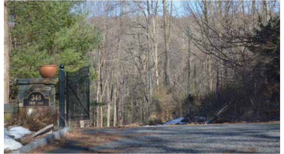
The entrance to the old Twin Oaks property on Whippoorwill Road in Chappaqua, which will be the site of Rockledge Farm.

However, Madeline Wachtel said the waste from the animals is dry manure, has