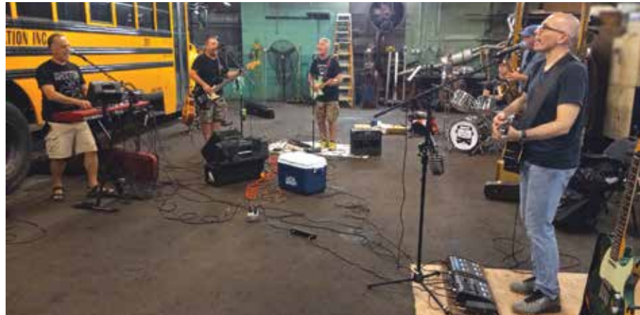
The Station Agents, comprised of seven husbands and fathers, practice inside Chappaqua Transportation's garage during a recent rehearsal. They will perform at the Town of New Castle's summer concert series on July 28.

They hope that local residents will come out to hear a fun mix of Springsteen, Mellencamp, Billy Joel and some singalong staples, such as "Brown Eyed Girl" and "Sweet Caroline."