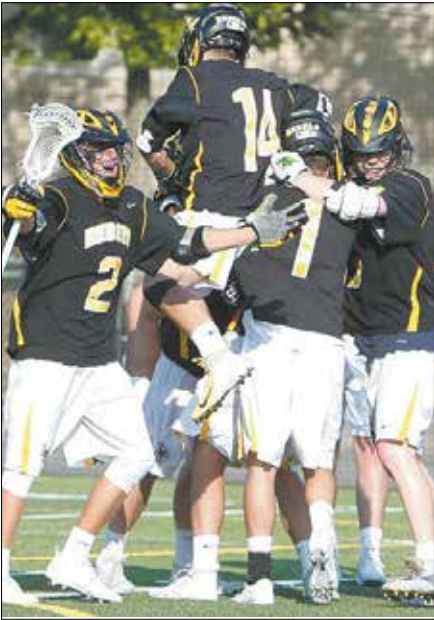
Lakeland-Panas players celebrate their Section 1 Class A quarterfinal win over Scarsdale.