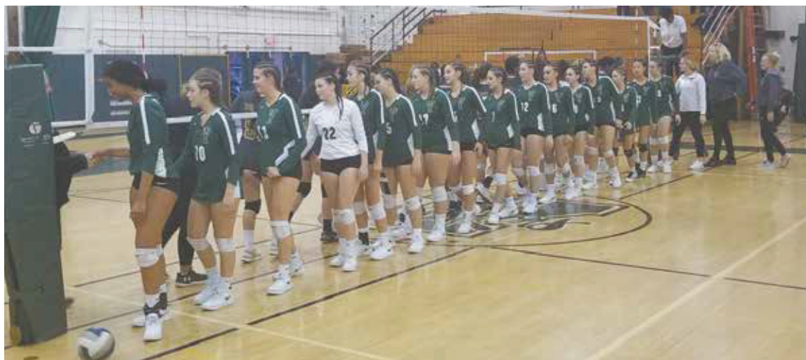
The youthful Yorktown volleyball team has made its presence felt this fall.