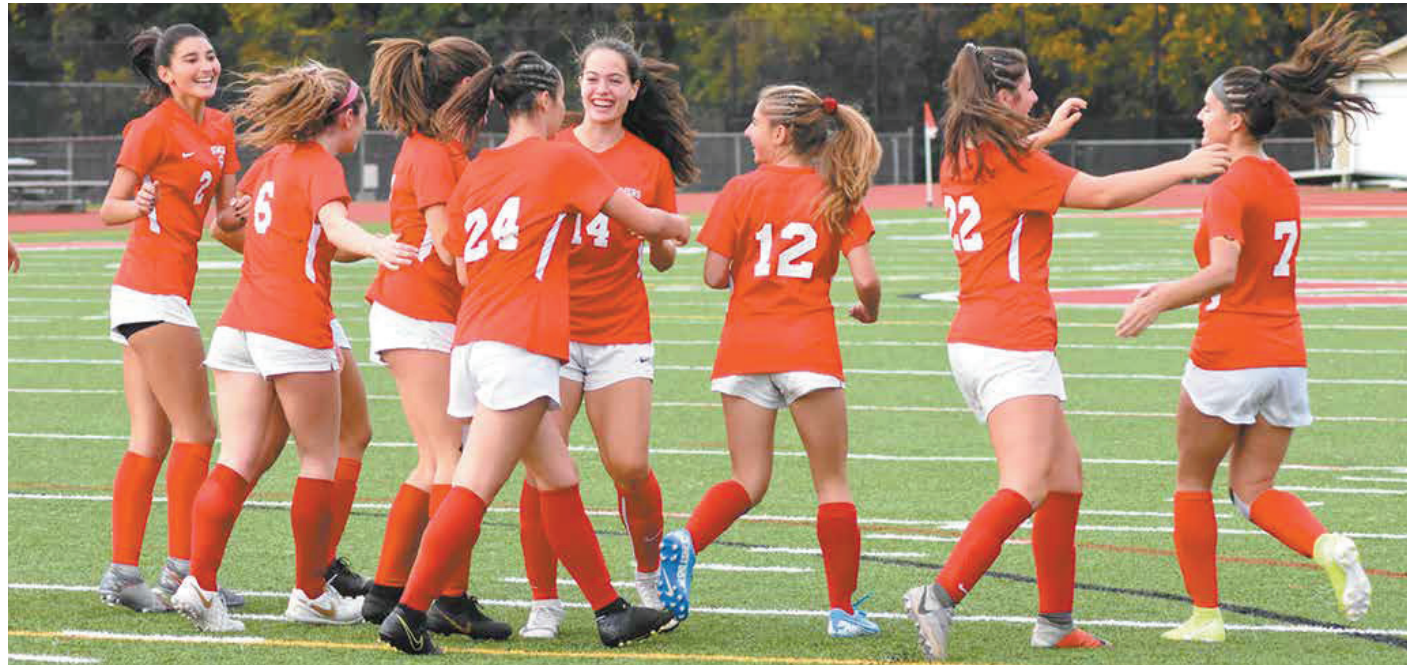
Somers girls are all smiles as they celebrate goal in 5-1 Class A playoff win over Hen hud Friday.