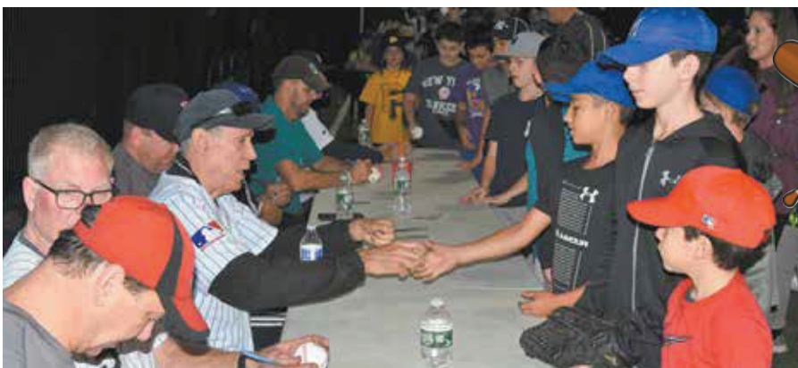
Local youngsters line up for autographs with former MLB greats at Carmel Sports Club who partnered with Family & Children's Aid & the MLB Alumni Association.