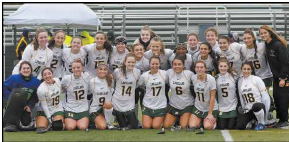
Members of the 2018 Section 1 Class B champion Lakeland Hornets pose after 6-1 title win over John Jay Saturday.