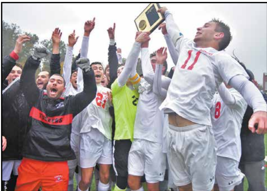
Tuskers jump for joy with Section 1 title plaque after 4-2 Section 1 Class A title win over Pearl River Saturday.