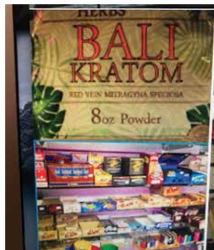
It is common to find kratom at vape shops throughout the Hudson Valley.

In Florida, you can buy it in gas stations and head shops. Not only can kratom contain heavy metals, but also fentanyl,