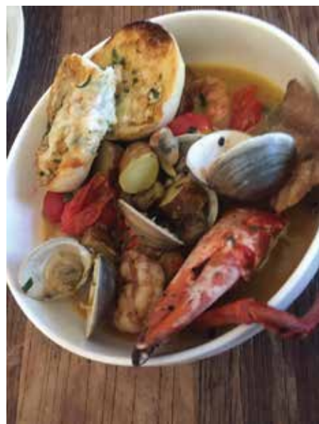
The Creole seafood stew would be a great choice for a meal on Mardi Gras, celebrated this year on Mar. 1.