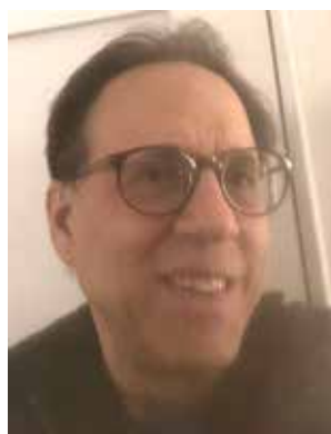
By Michael Gold

The American Kratom Association (AKA) claims kratom is a safe herbal supplement that can be used to manage chronic pain or boost your energy. The AKA also promotes it to help withdraw