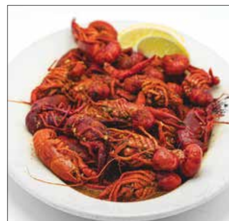
The crawfish boil at The Bayou Restaurant in Mount Vernon. The Bayou is one of a growing selection of restaurants throughout Westchester that serves Cajun and Southern-style cooking, just in time for Fat Tuesday.

Brothers Nursery, 1202 Old Post Rd. (Route 35), South Salem. Operates year-round. Saturdays from 9 a.m. to 1 p.m. Info: Visit www.gossettbrothers.com .