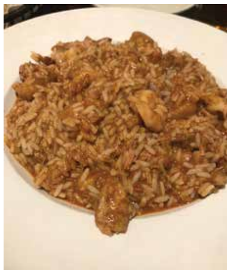
The hearty mixed jambalaya bowl and the shrimp po' boy, right, with sweet potato fries and coleslaw are two of the delicious selections at the Rye Roadhouse.

Southern Table Kitchen & Bar , 39 Marble Ave. in Pleasantville, offers a big dose of Southern hospitality along with house specialties such as fried green tomatoes, cheddar biscuits, grit bowls, Cajun-style seafood boils and chicken and waffles. There's good fried chicken, too. Open daily.