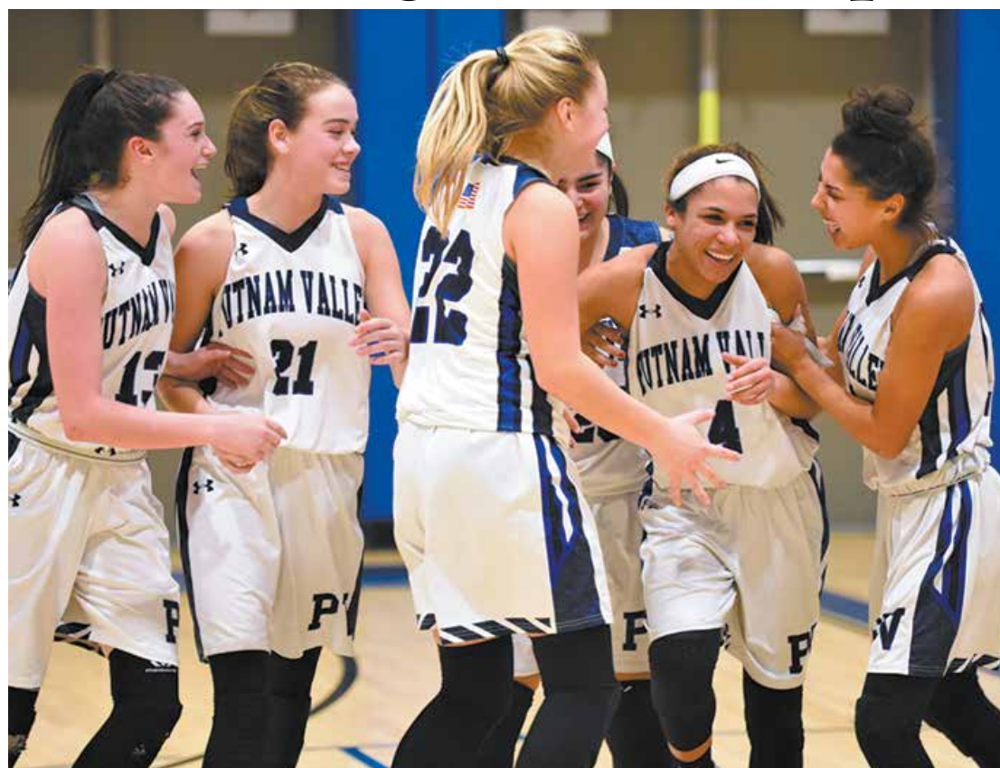
Putnam Valley returns a ton of talent for a run in Class B this winter