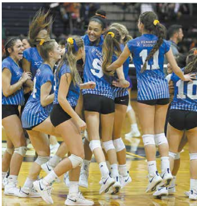
Members of the Hen Hud volleyball dynasty storm court after winning program's 15th Section 1 title in 20 years Saturday at Pace University.