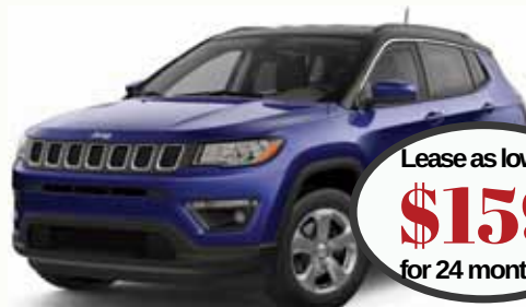
2018 JEEP COMPASS Latitude