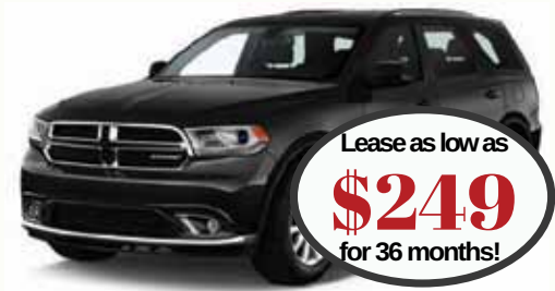
2018 DODGE DURANGO SXT AWD