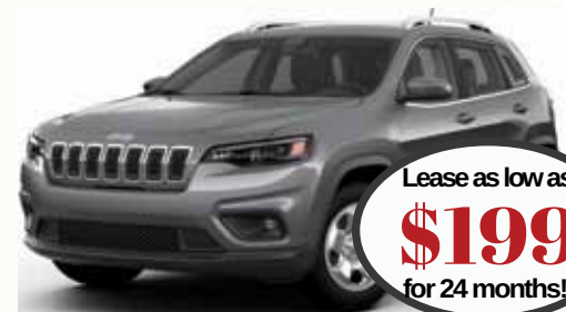
2019 JEEP CHEROKEE Latitude Plus 4x4