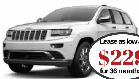
2018 JEEP GR CHEROKEE Laredo