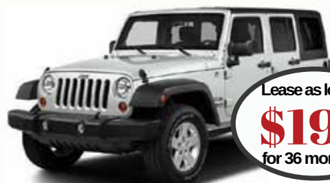
2018 JEEP WRANGLER J/K Unlimited Sport 4x4