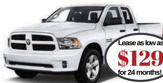
2018 RAM 1500 Q/C Express